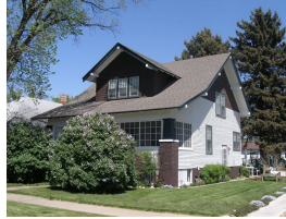
Borgens House, 415 13th Street

26 Thursday – Lunch 'n Learn: The Sinking of the Edmund Fitzgerald. Greeley Freight Station Museum, 680 10 th Street, 12–1 p.m.