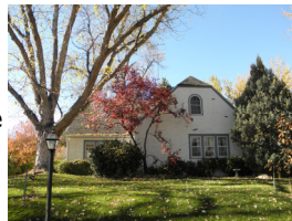
Neill House, 1863 13th Avenue

28 Thursday – Lunch 'n Learn: Baseball History. Greeley History Museum Community Room, 714 8 th Street, 12–1 p.m.