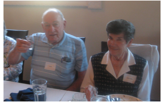
Bring your Valentine or maybe meet a Valentine at the February Gabbie on Valentine's Day!

Pack your sack lunch & water for our Cross Country Ski & Snowshoe Trips . Visit Devil's Thumb Ranch on Friday, Feb. 3 and Cameron Pass on Friday, Feb. 17. You are responsible for renting snowshoes or skis prior to the 7:45am departure. Fees for each trip are $15 members, $20 non-members. Additional trail fees are required the day of each trip. PLEASE NOTE: Trails at Cam-