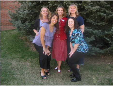
The Senior Center Staff welcomes all the new members!