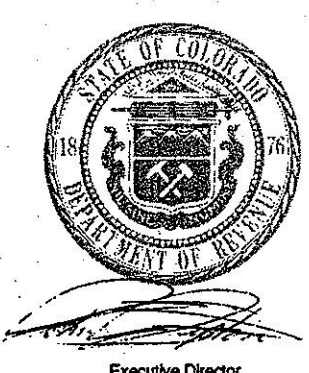
Executive Director Department of Revenue