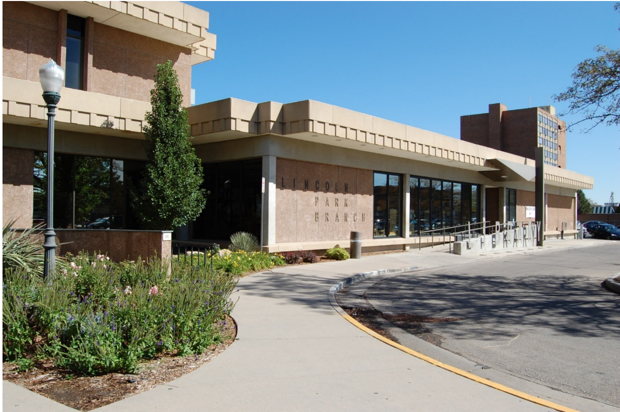
City of Greeley, Colorado