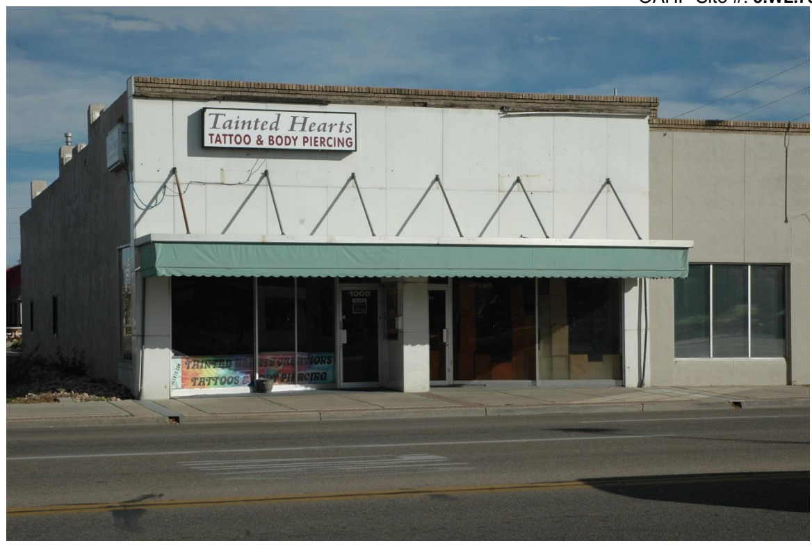
CD 1, Image 136, View to ESE of façade (west)