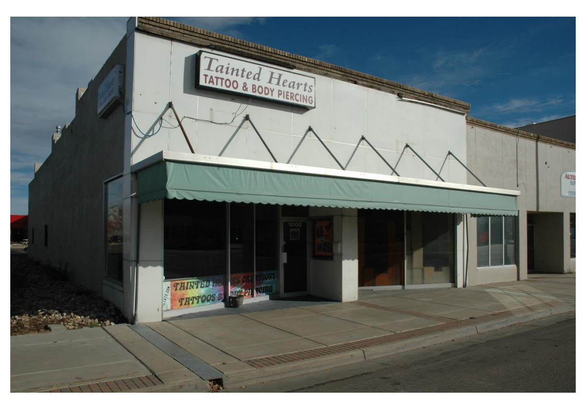
CD 1, Image 144, View to SE of façade (west) and north side