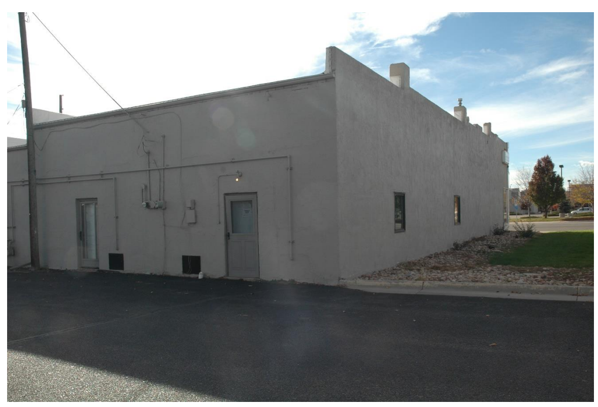
CD 1, Image 145, View to SW of rear (east) and north side