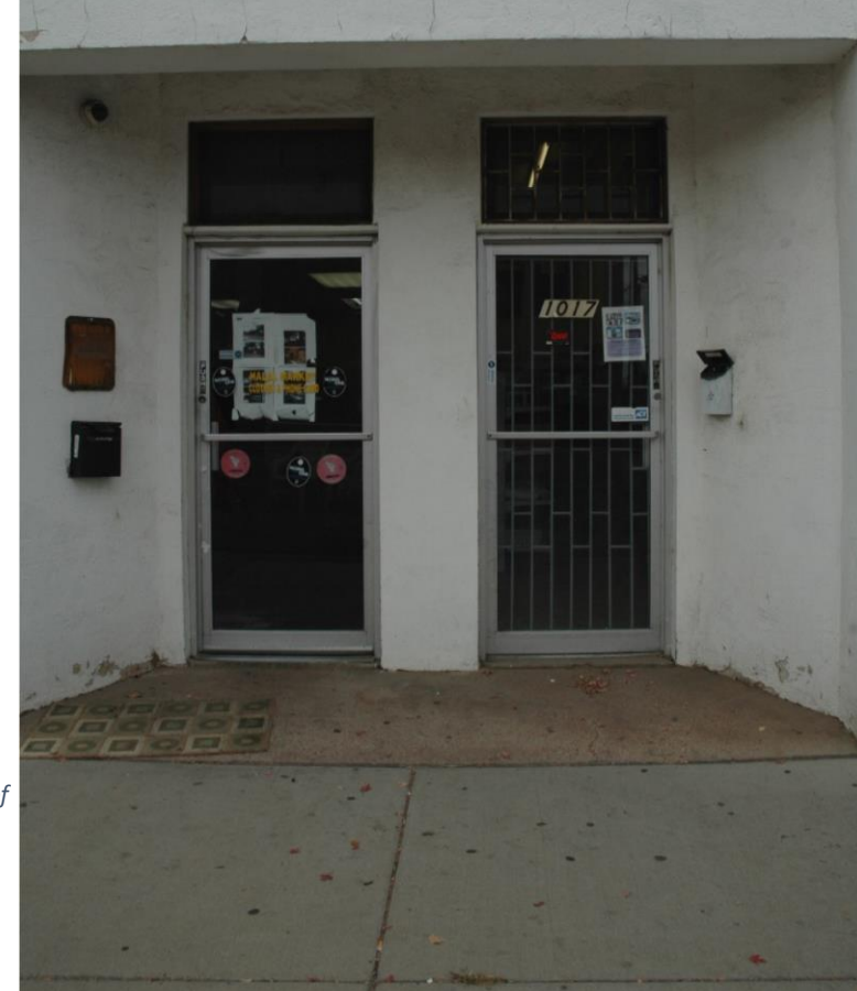
CD 1, Image 4, View to west of Entryway