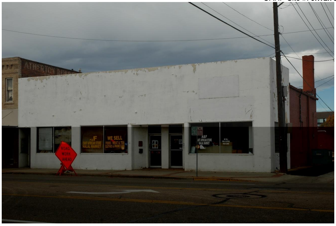
CD 1, Image 1, View to WSW of façade (west)