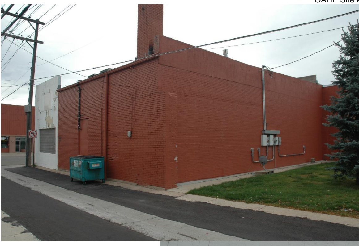
CD 1, Image 3, View to SE of rear SW corner