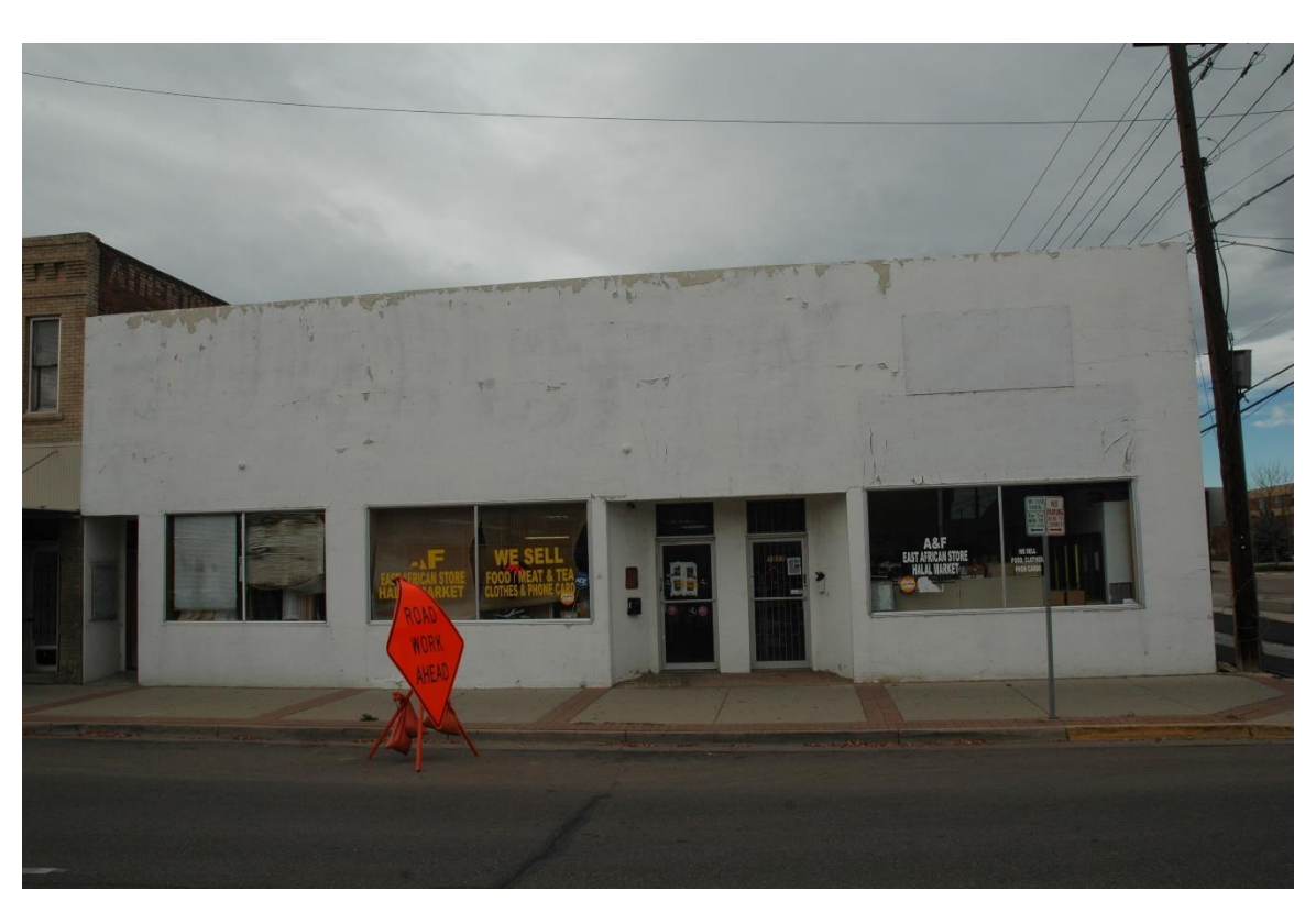
CD 1, Image 2, View to west of façade (east)