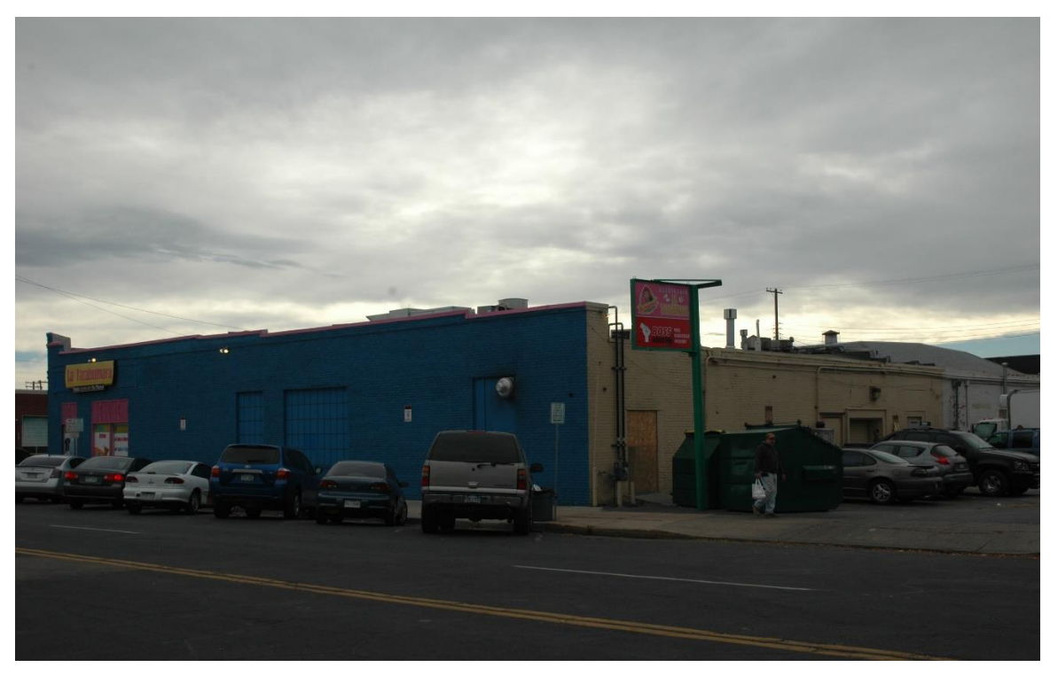
CD 1, Image 14, View to SE of north side and of rear (west)