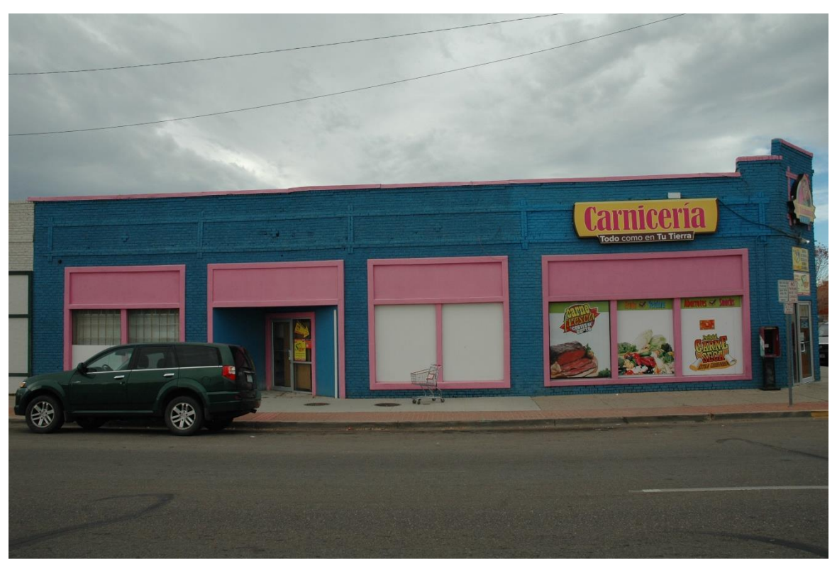
CD 1, Image 16, View to west of façade (east)