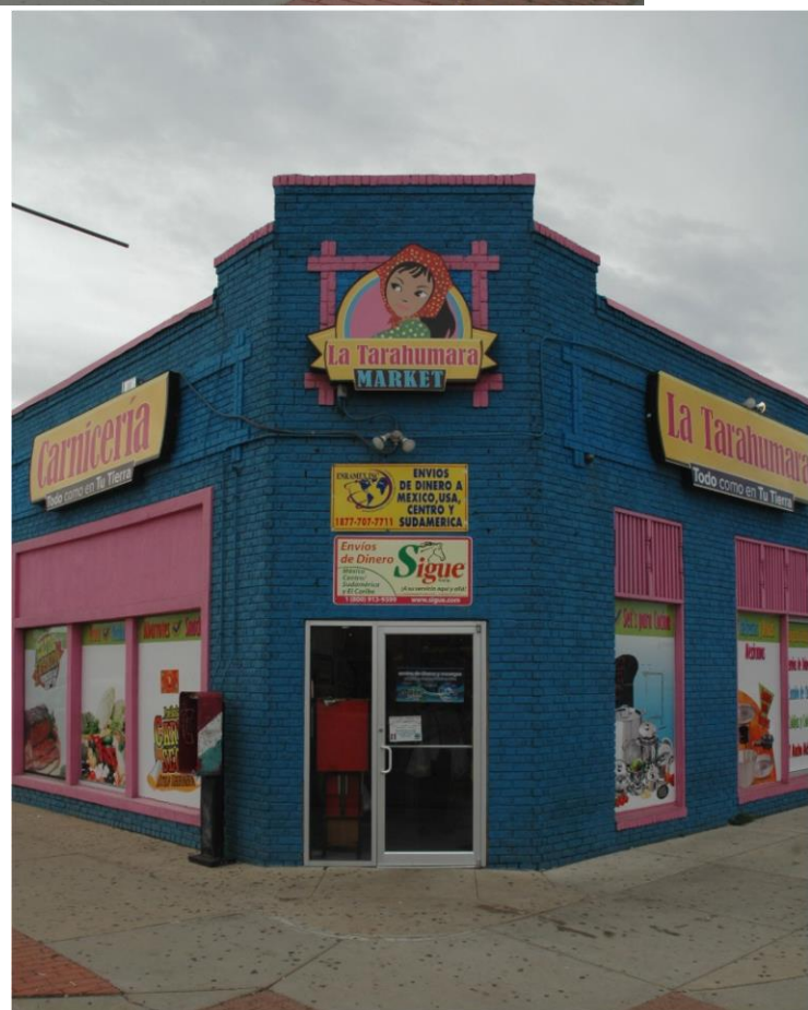
CD 1, Image 17, View to SW of corner entry