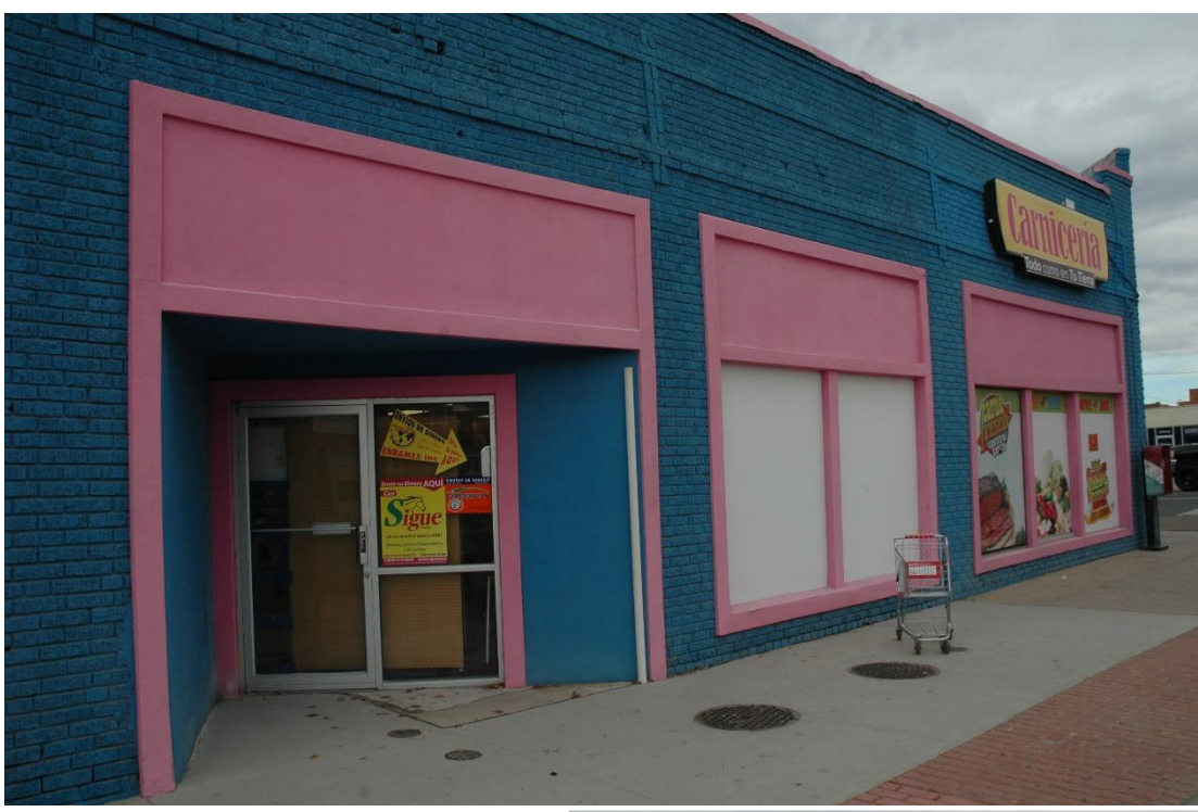
CD 1, Image 19, View to NW of façade (east)