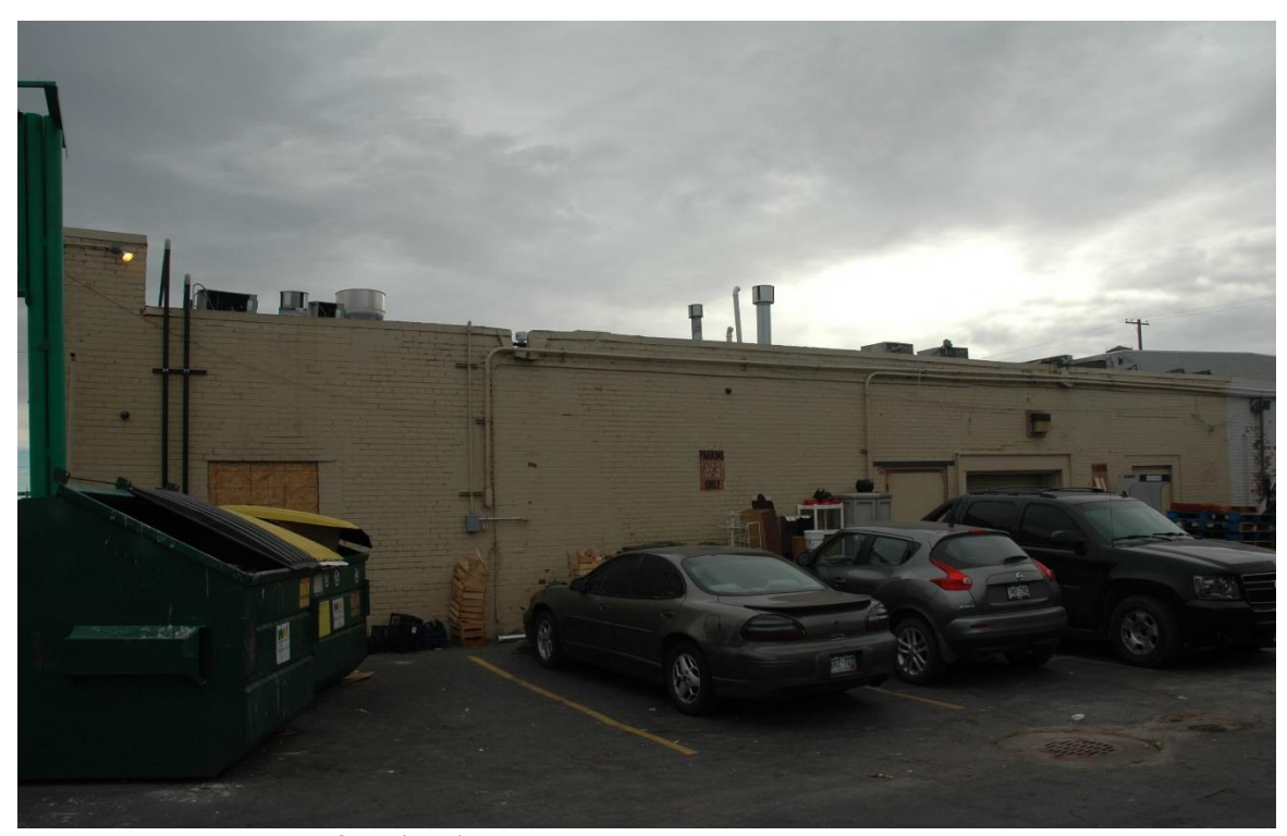
CD 1, Image 18, View to ESE of rear (west)