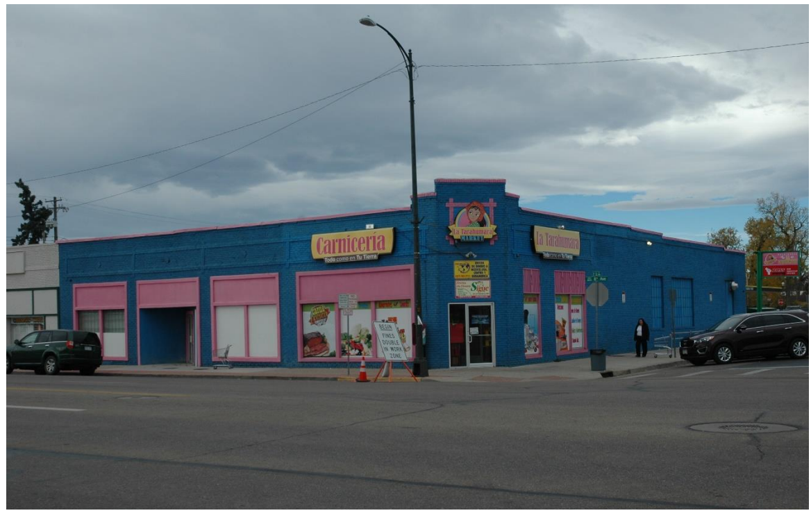
CD 1, Image 15, View to SW of façade (east) and of north side