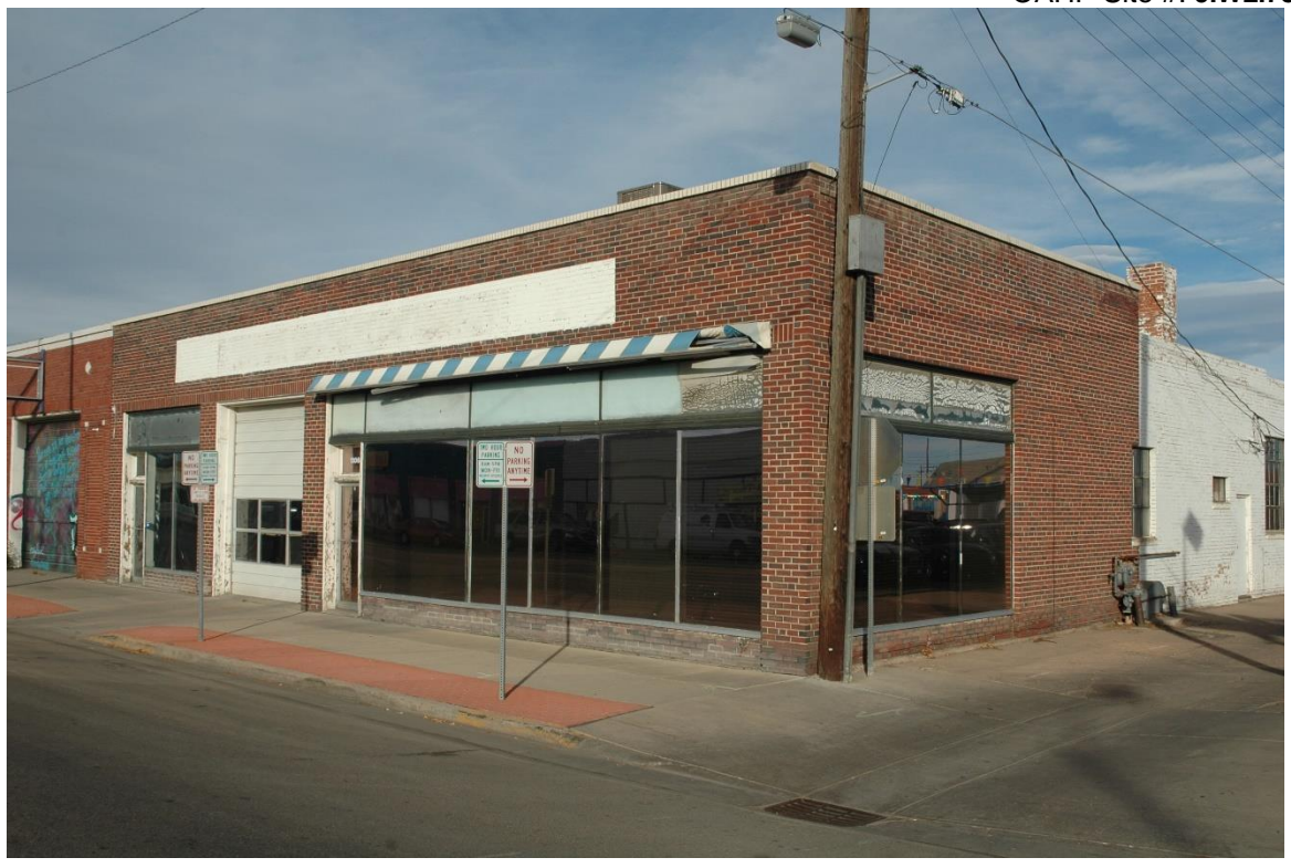
CD 1, Image 179, View to NE of façade (west) and west end of south side