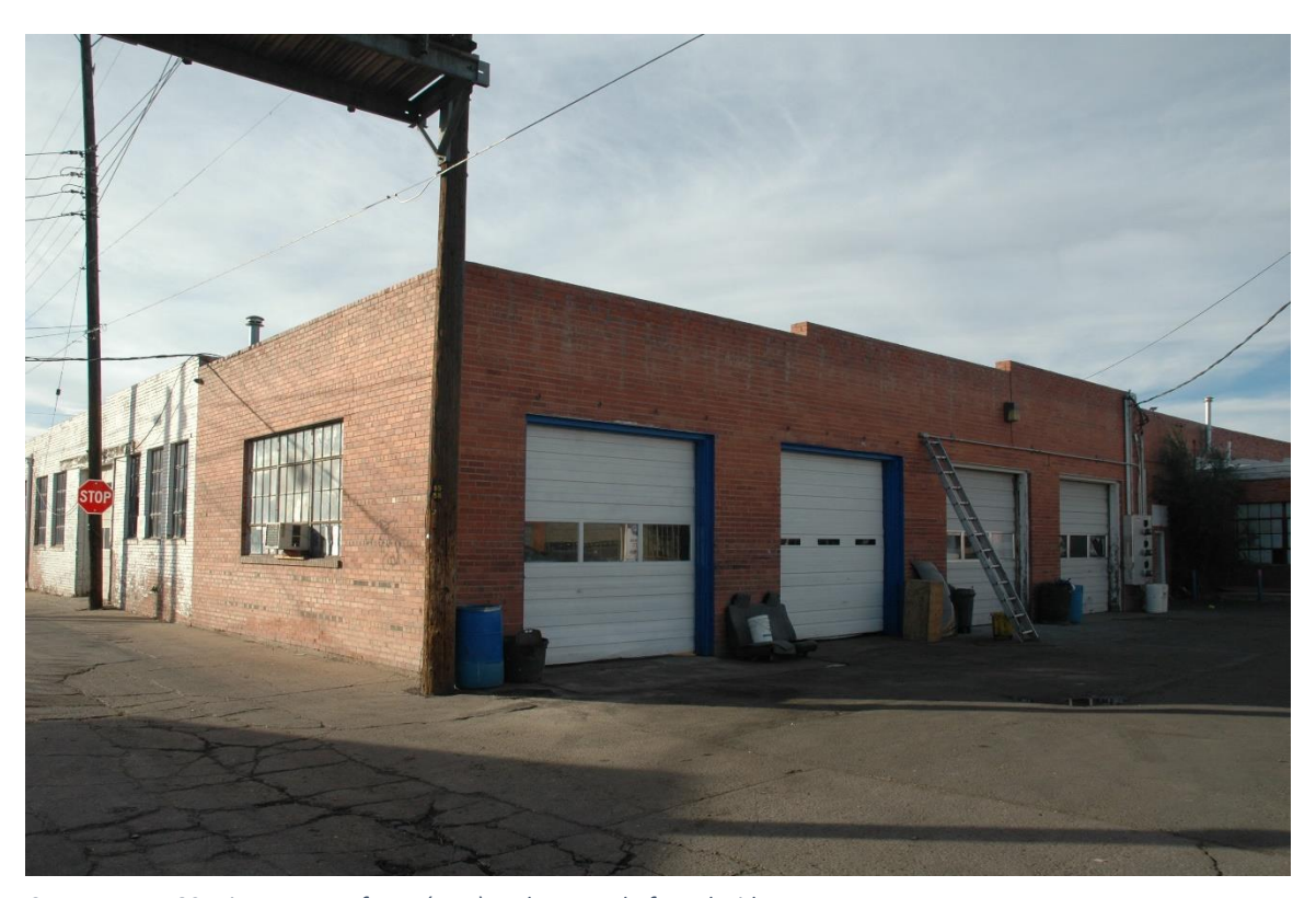
CD 1, Image 180, View to NW of rear (east) and east end of south side