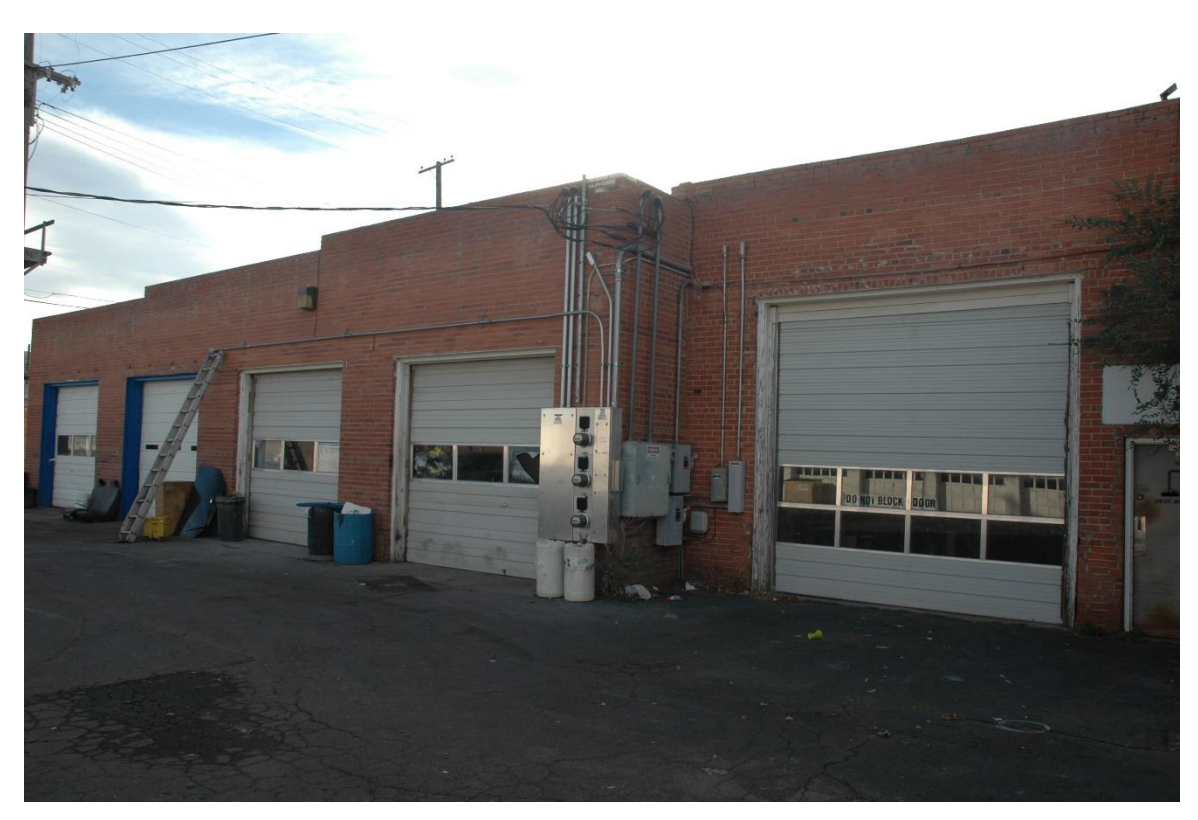
CD 1, Image 181, View to WSW of rear (east)