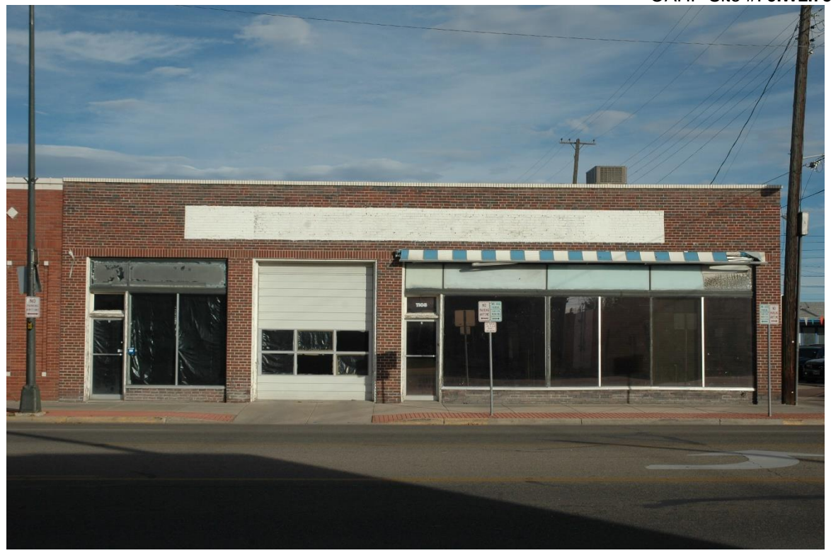
CD 1, Image 177, View to east of façade (west)