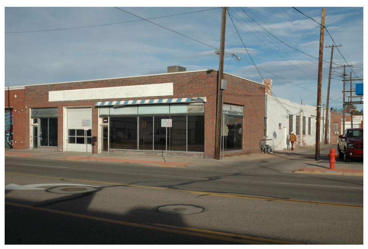
CD 1, Image 178, View to NE of façade (west) and south side