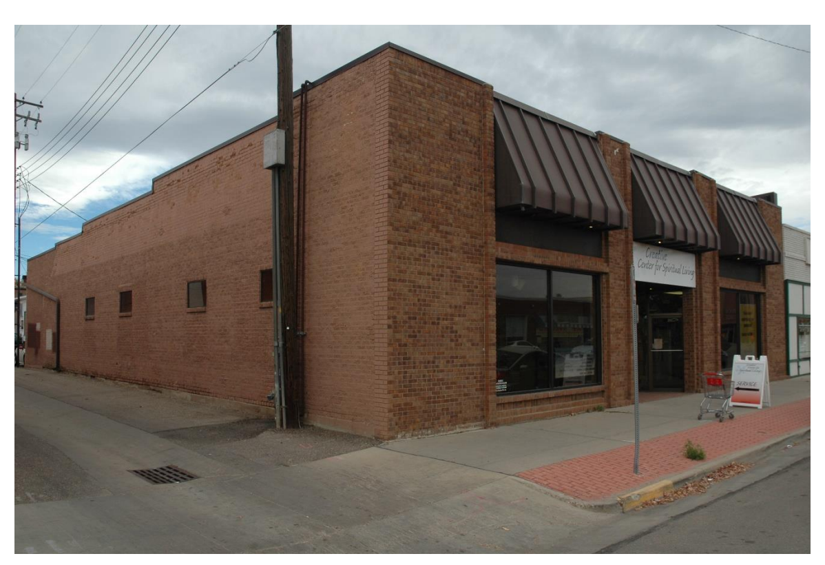
CD 1, Image 27, View to NW of façade (east) and south side