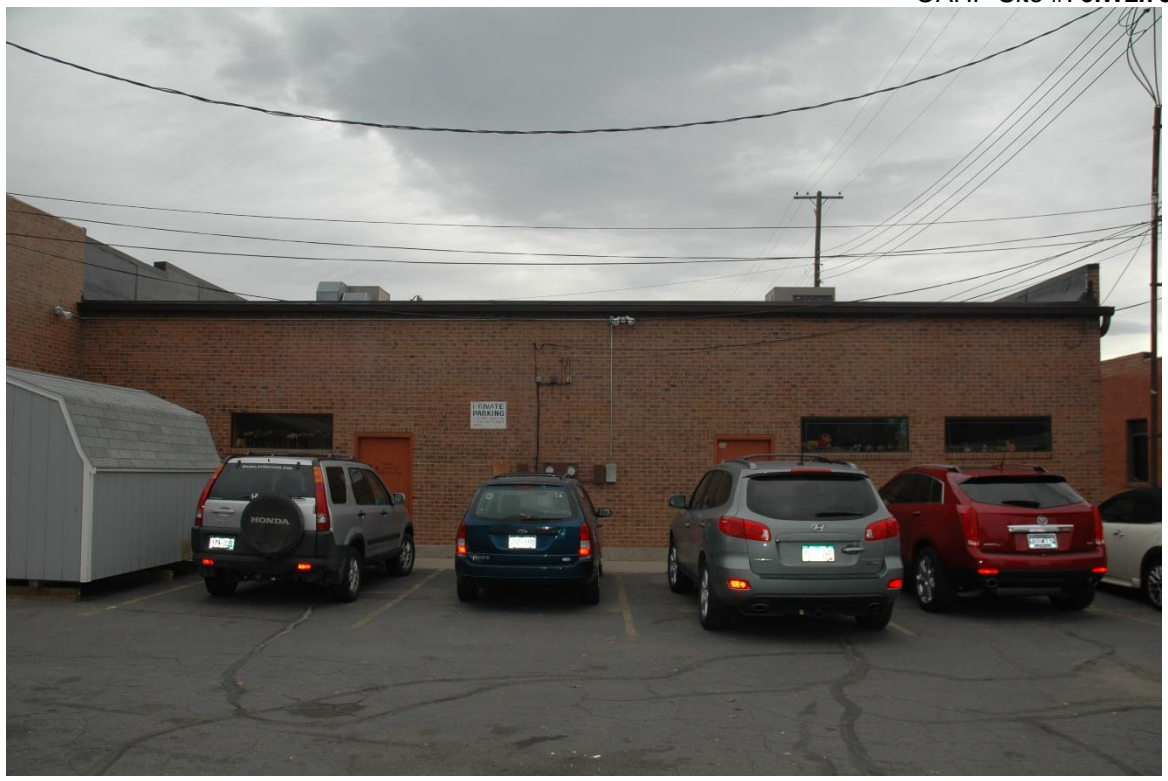
CD 1, Image 24, View to east of rear (west)