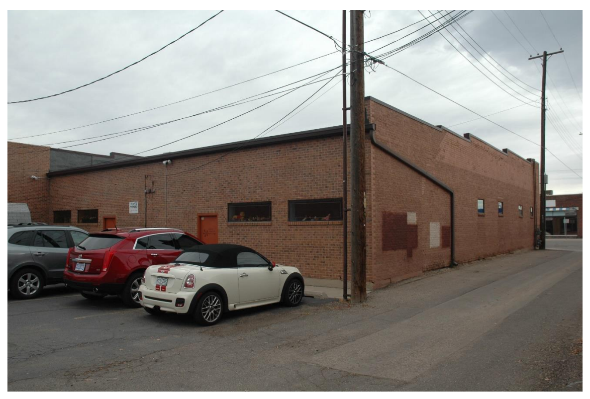
CD 1, Image 25, View to NE of rear (west) and south side