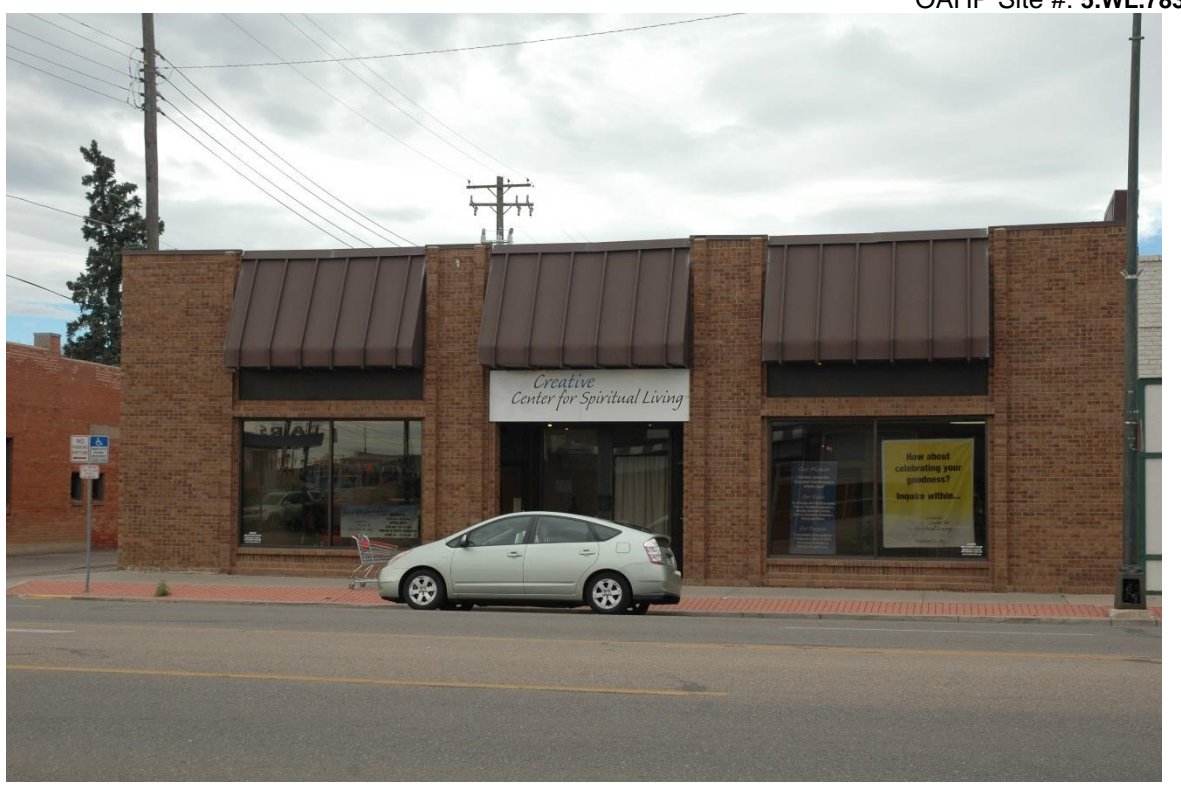
CD 1, Image 26, View to west of façade (east)