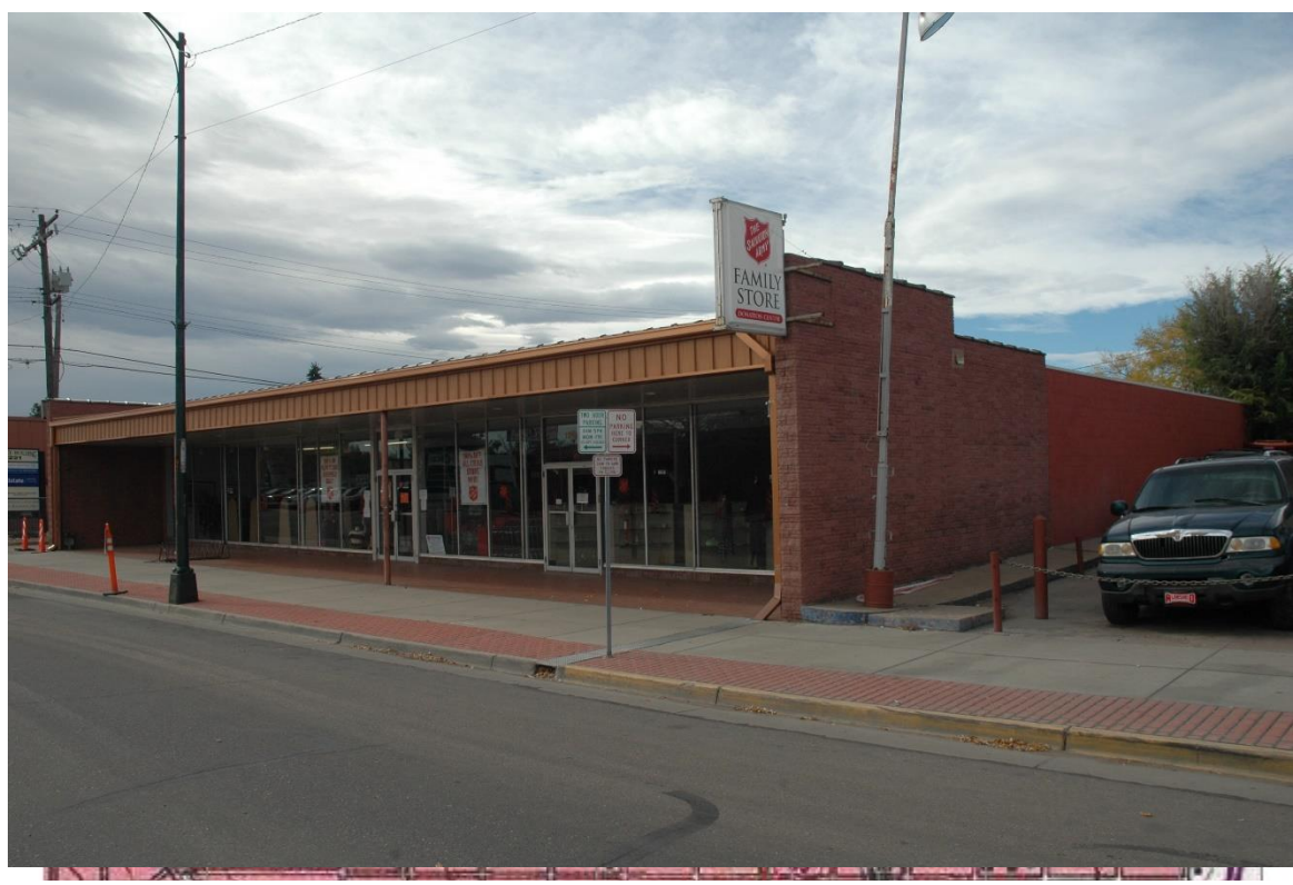
CD 1, Image 44, View to SW of façade (east) and north side