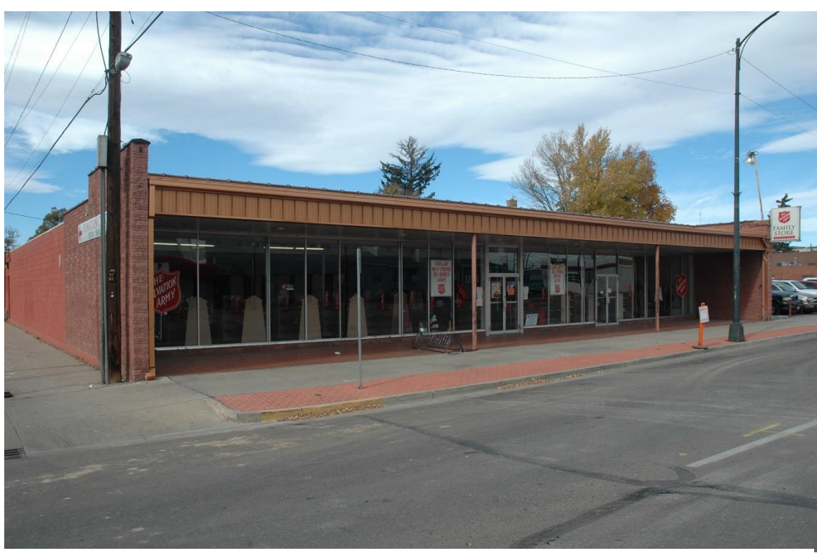
CD 1, Image 45, View to NW of façade (east) and south side