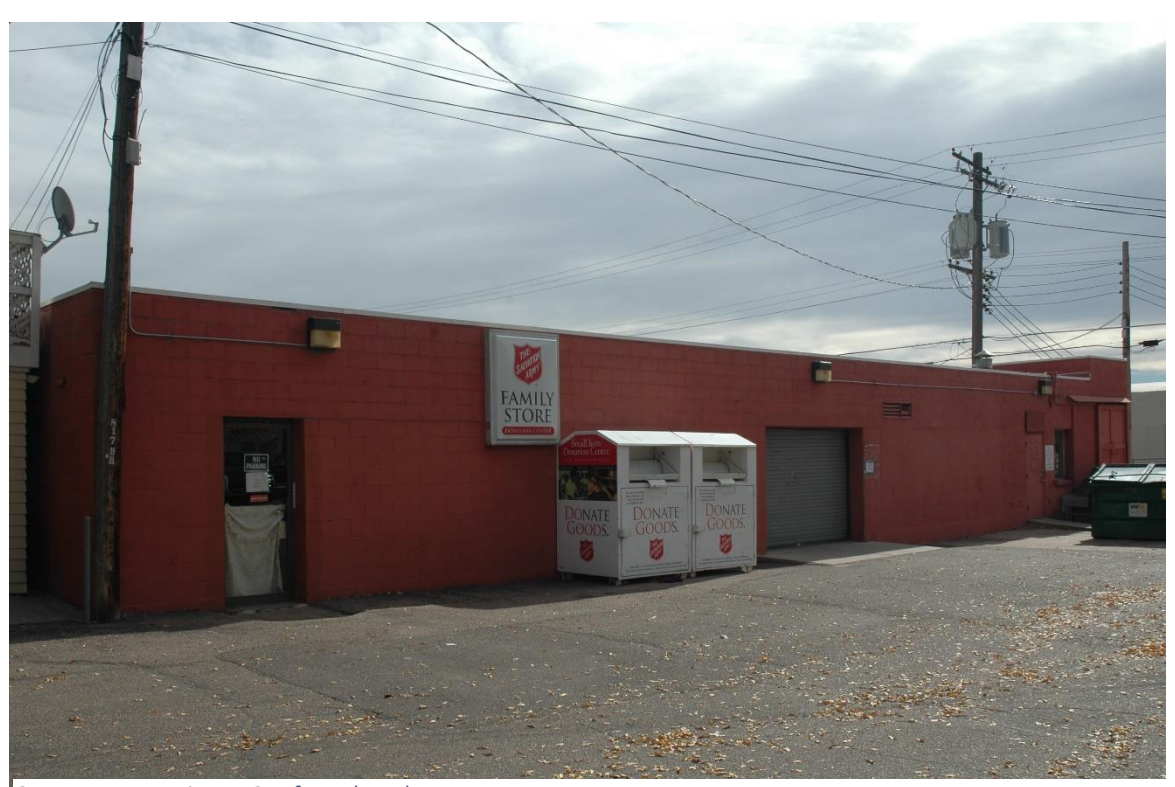
CD 1, Image 47, View to SE of rear (west)