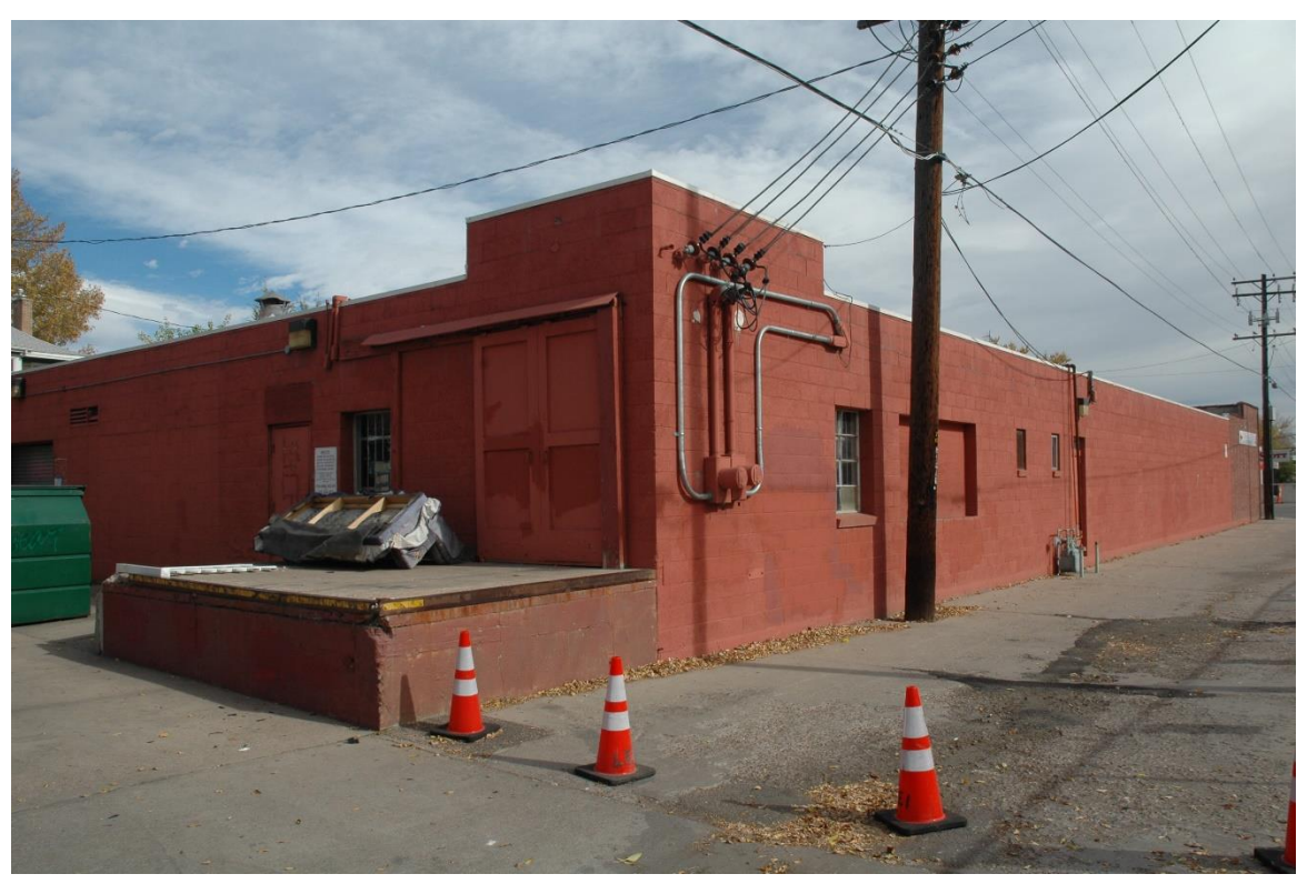
CD 1, Image 46, View to NE of south side and rear (west)