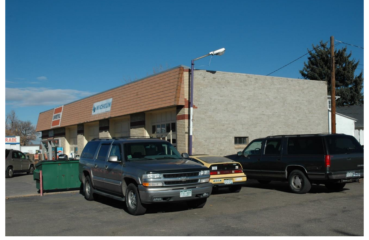
CD 2, Image 1, View to NE of façade (west) and south side