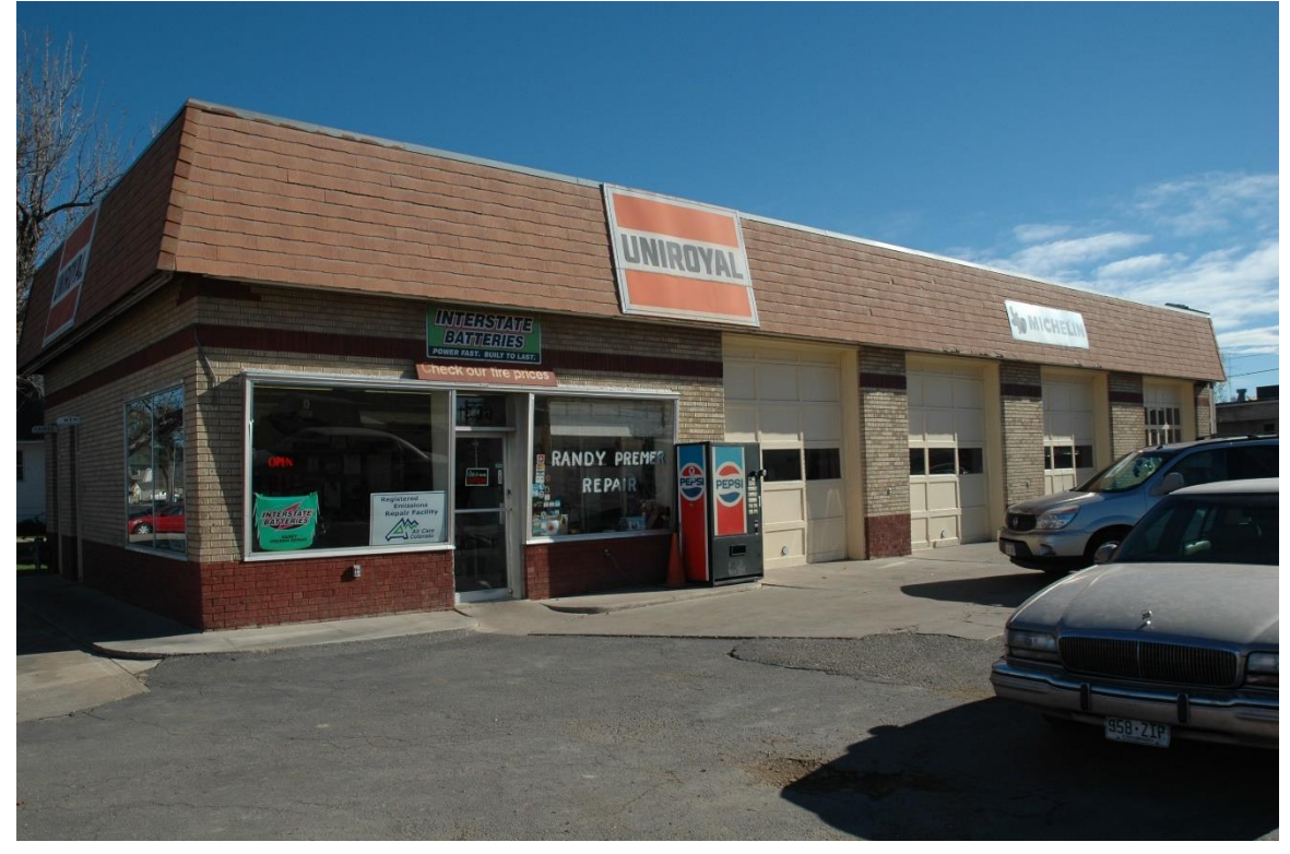
CD 1, Image 2, View to SE of façade (west)