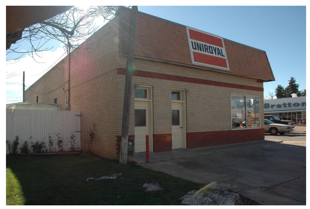
CD 2, Image 3, View to SW of north side and rear (east)