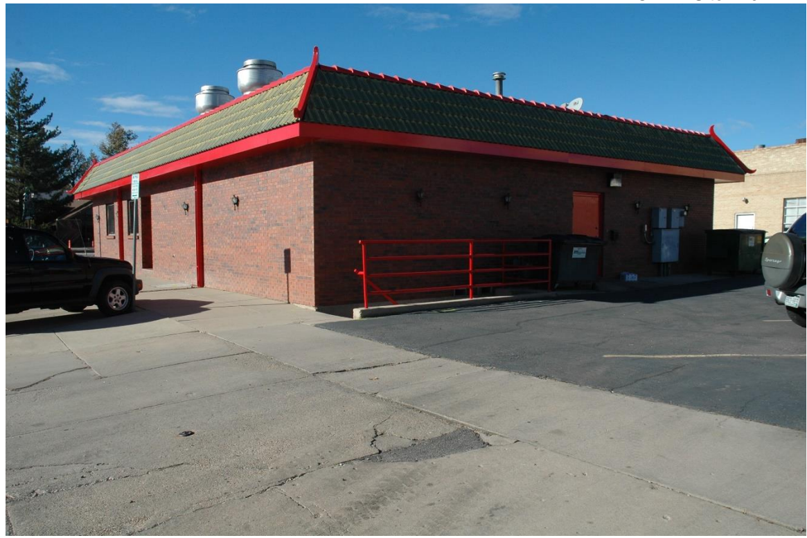
CD 2, Image 13, View to NW of south side and rear (east)