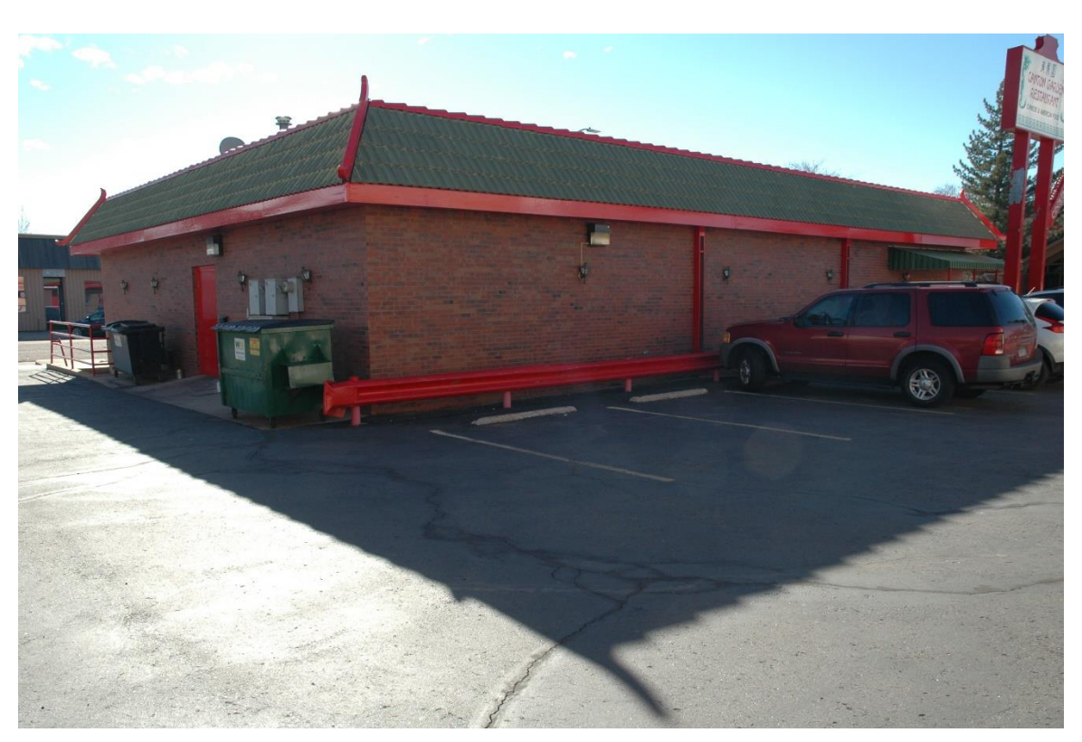
CD 2, Image 14, View to SW of rear (east) and north side