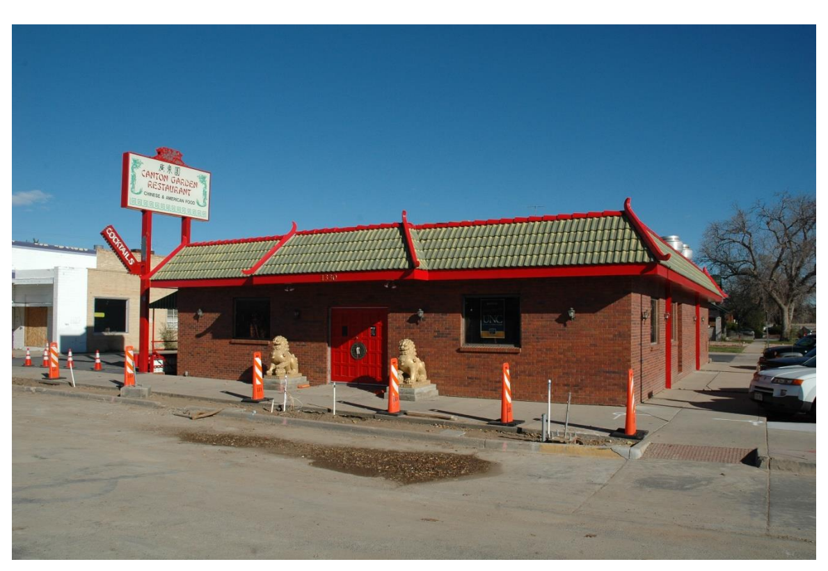
CD 2, Image 12, View to ENE of façade (west)