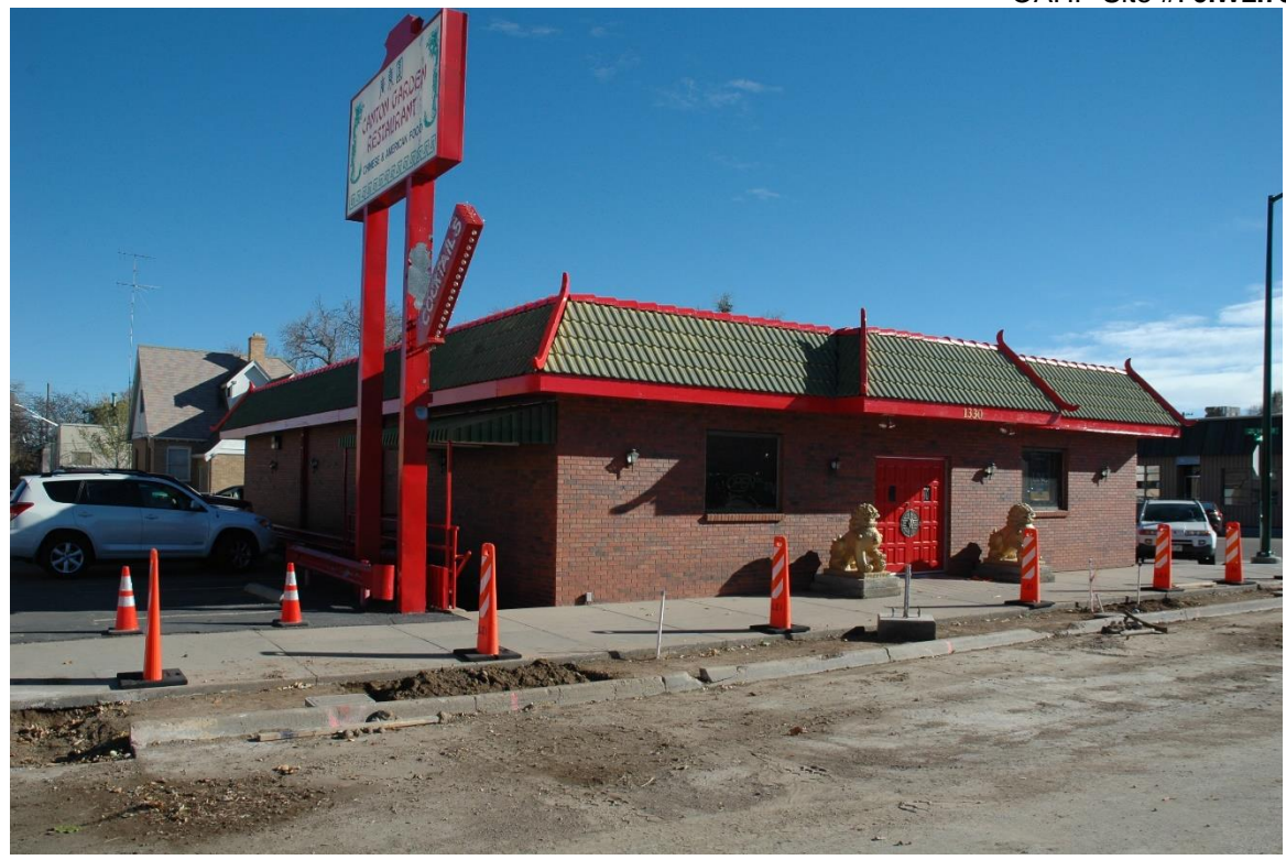
CD 2, Image 11, View to SE of façade (west) and north side