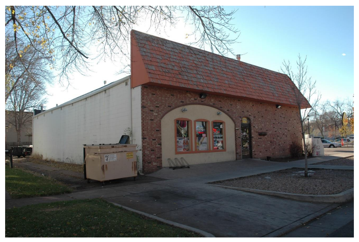
CD 2, Image 34, View to SW of east side and of front of building facing 15^{th} Street to the north