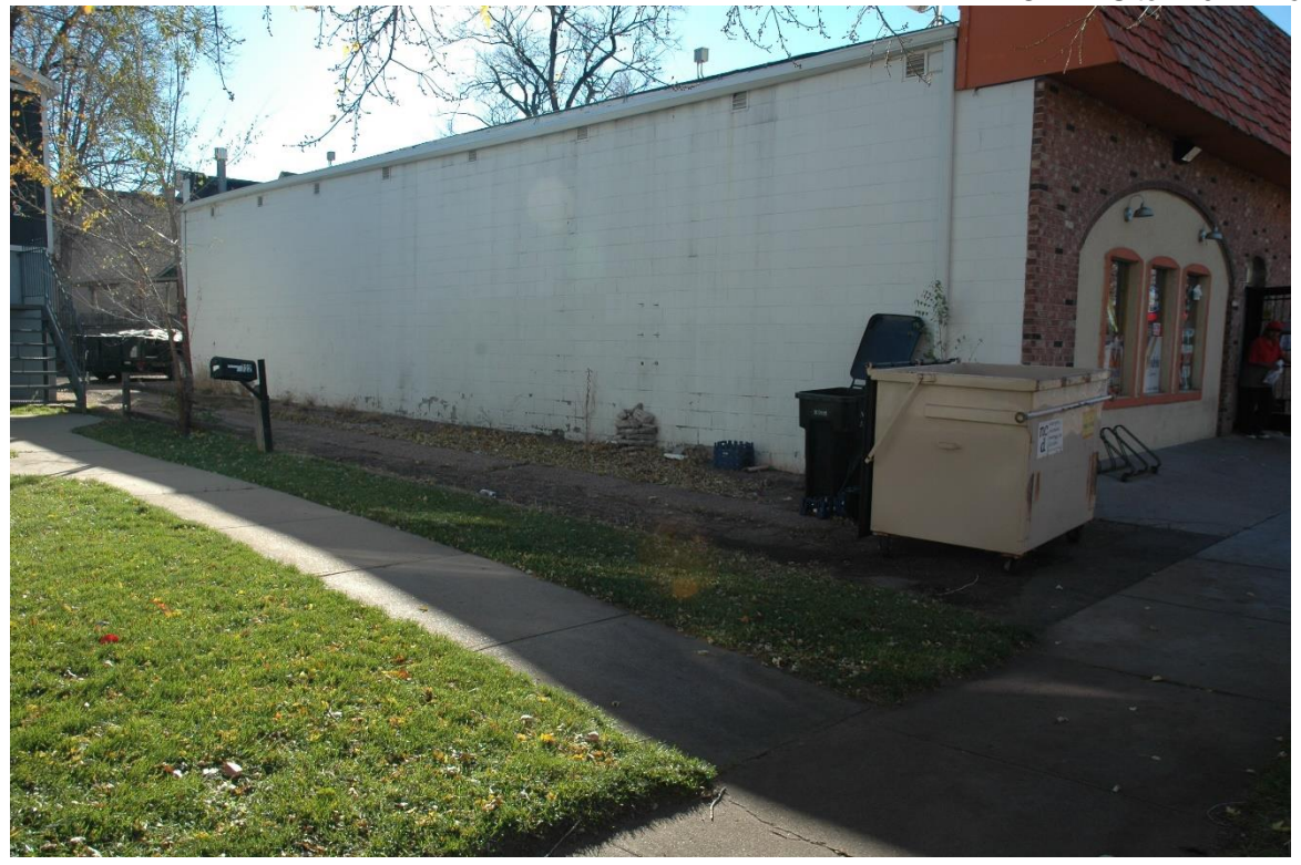
CD 2, Image 33, View to SW of east side