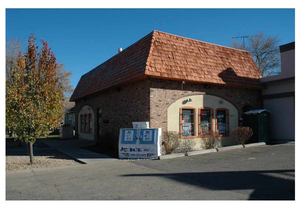
CD 2, Image 35, View to NE of west side and of front of building facing 15^{\rm th} Street to the north