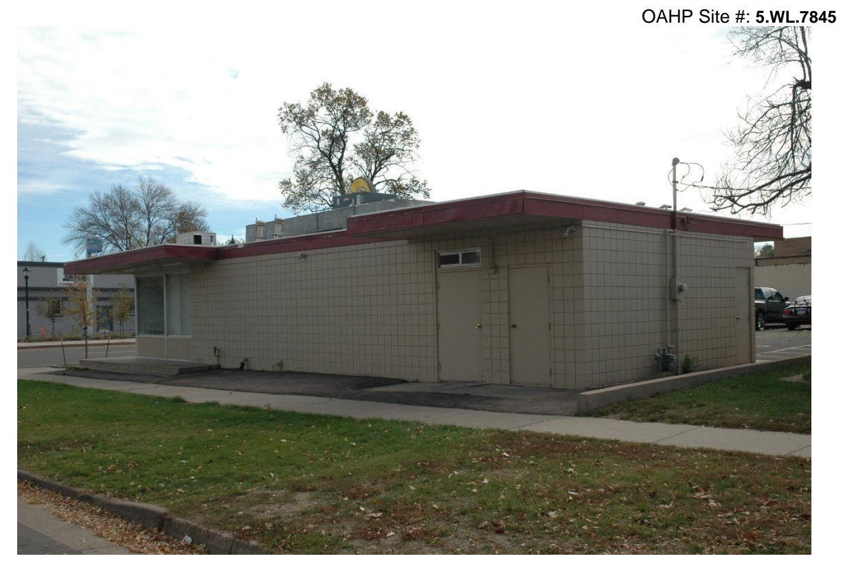
CD 1, Image 93, View to SE of rear (west) and of north side