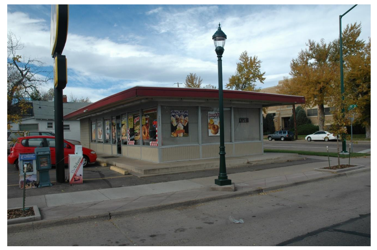
CD 1, Image 94, View to NW of east and south sides