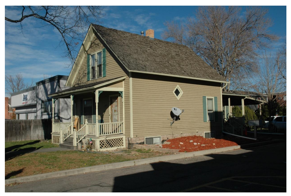
CD 2, Image 40, View to NE of façade (west) and south side

Cultural Resource Historians 1607 Dogwood Court, Fort Collins, CO 80525 (970) 493-5270