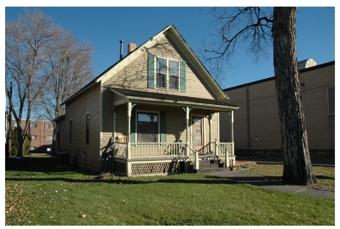
CD 2, Image 39, View to SE of façade (west) and north side