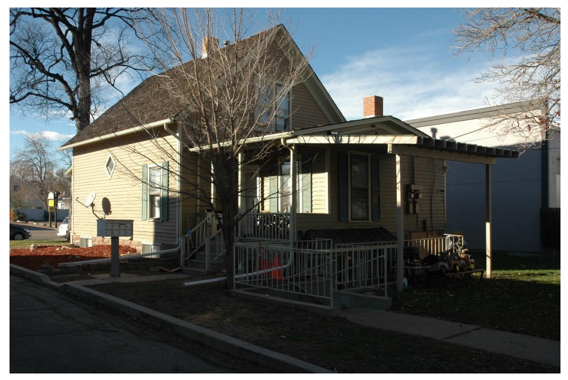
CD 2, Image 41, View to NW of south side and rear (east)