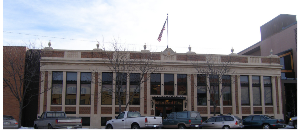
Greeley History Museum, Historic Greeley Tribune Building, 714 8th Street. Site of Lunch 'n Learn series and Researching Historic Property Workshop

The Commission and staff hosted several more new events in 2011. The Historic Preservation Staff worked with Museum Staff to host a workshop on Researching Your Historic Property in February 2011, which eleven people attended and which included a hands-on research component.