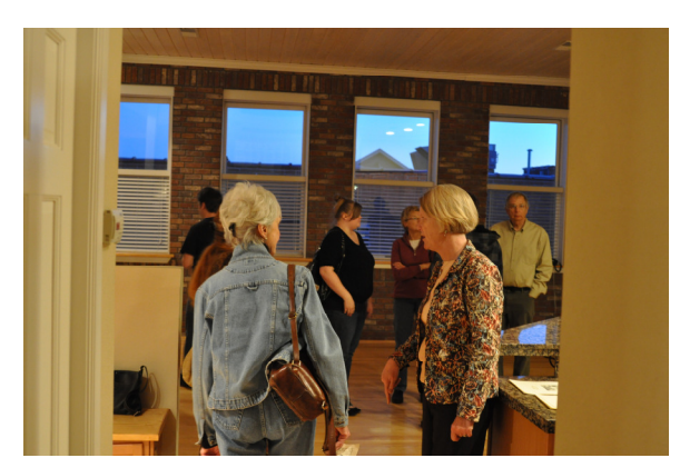
Participants in the loft tours, March 2011.

In May, the Commission celebrated Historic Preservation Month with a reception at the National Board of Chiropractic Examiners Building with 68 people in attendance. World War II and the POW Camp 202 were the theme for the reception, with presentations to property owners and award winners, and presentations about the POW Camp and about World War II.