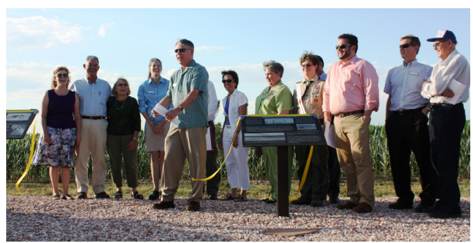
Ribbon cutting, July 25, 2011.

History Colorado Certified Local Government grant. Approximately 50 people attended the ribbon cutting ceremony, and Colorado Preservation, Inc. awarded participating organizations with certificates indicating the pillars were a "SAVE" on the Endangered Places List, including to the Colorado Department of Transportation, the City of Greeley, Historic Greeley, Inc., Boy Scouts of America, and the Daughters of the American Revolution.