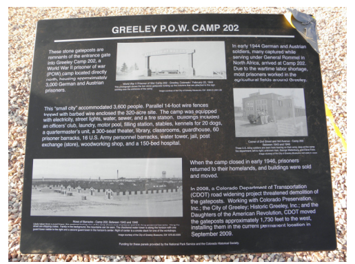
POW Camp 202 Interpretive Panel