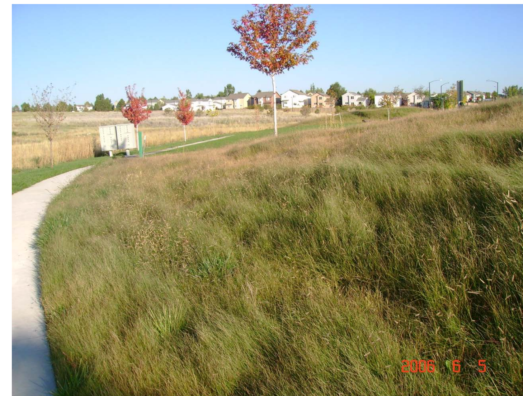
BLUE GRAMA (UNMOWED)