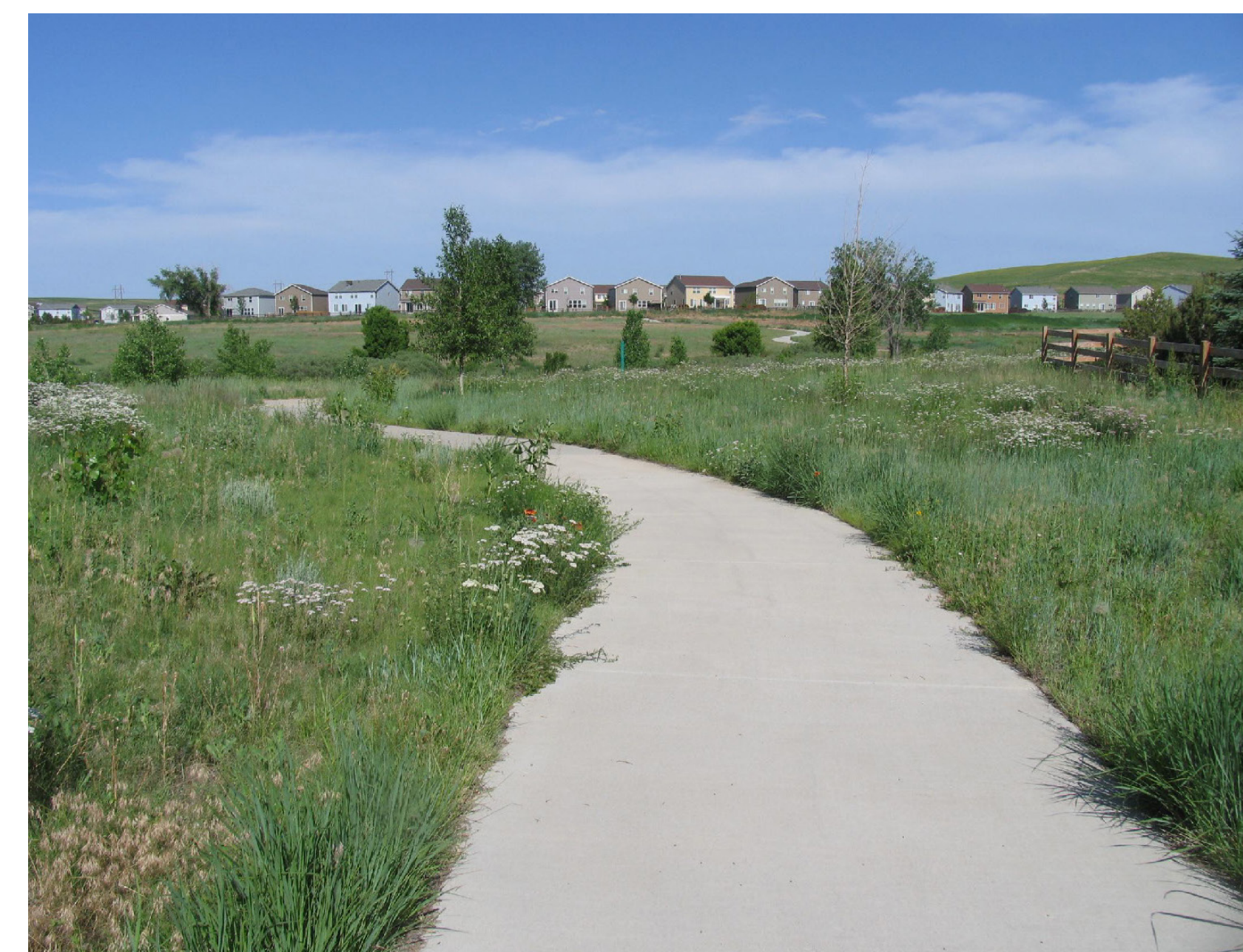
MIXED PRAIRIE GRASSES (UNMOWED)