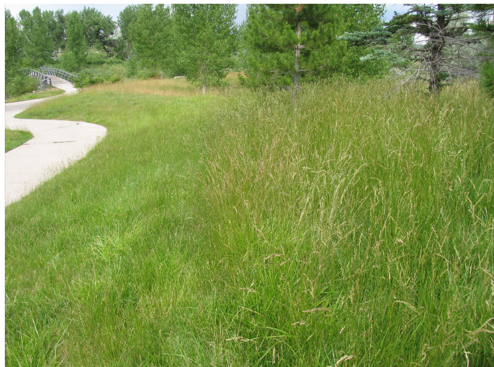
FINE FESCUE (MOWED AND UNMOWED)