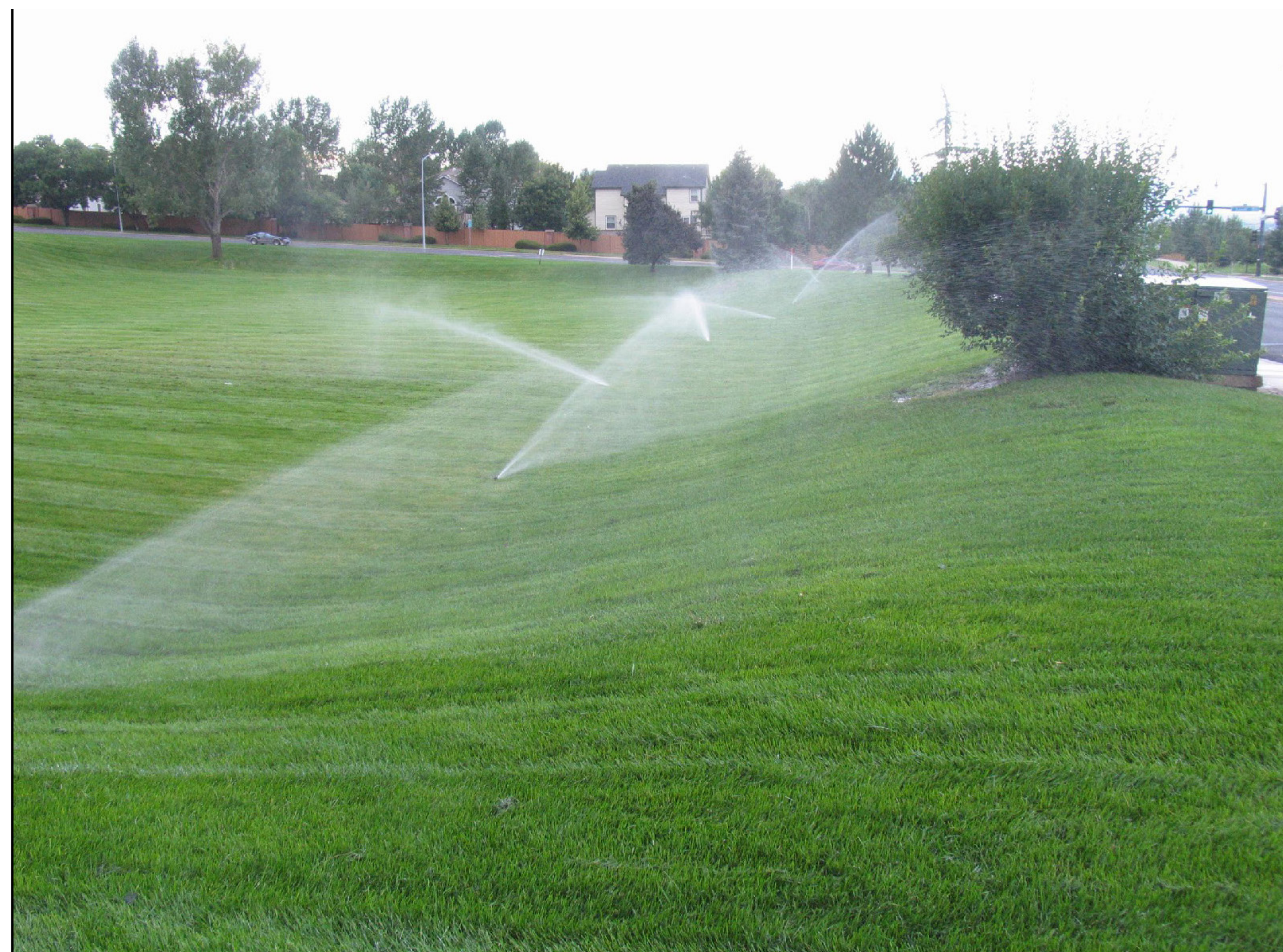
KENTUCKY BLUEGRASS (IRRIGATED AND MOWED)