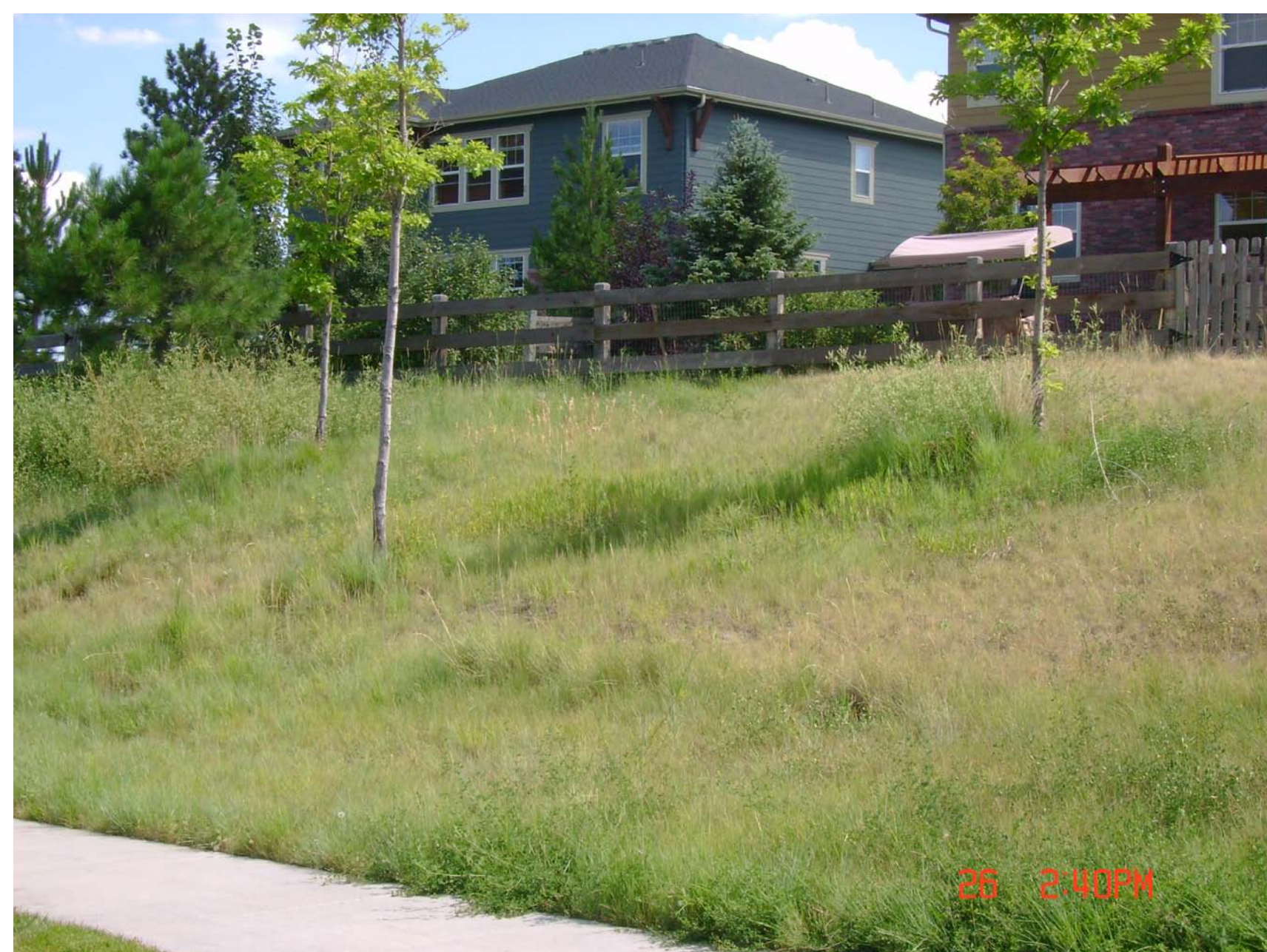
NATURALIZED GRASS MIX (UNMOWED)