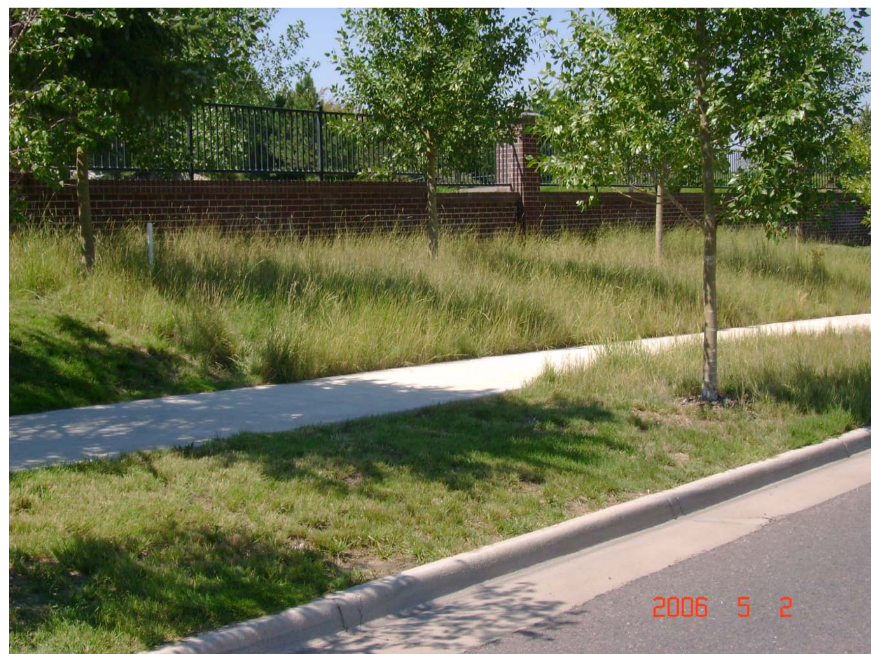
WHEATGRASS (MOWED AND UNMOWED)