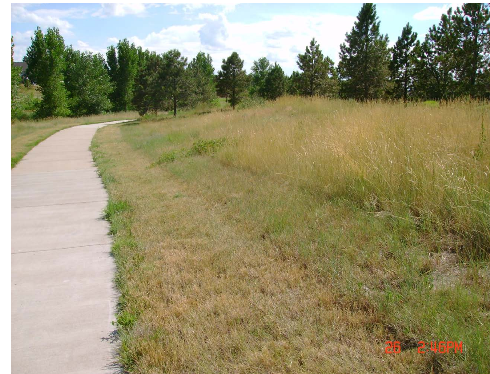
NATURALIZED GRASS MIX (3 MOW HEIGHTS)