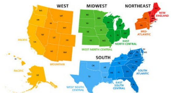
UNITED STATES CENSUS REGIONS AND DIVISIONS

Nationally, the South was the fastest growing region in the United States, with a 10.2% increase in population over the last decade (see map to right for reference).