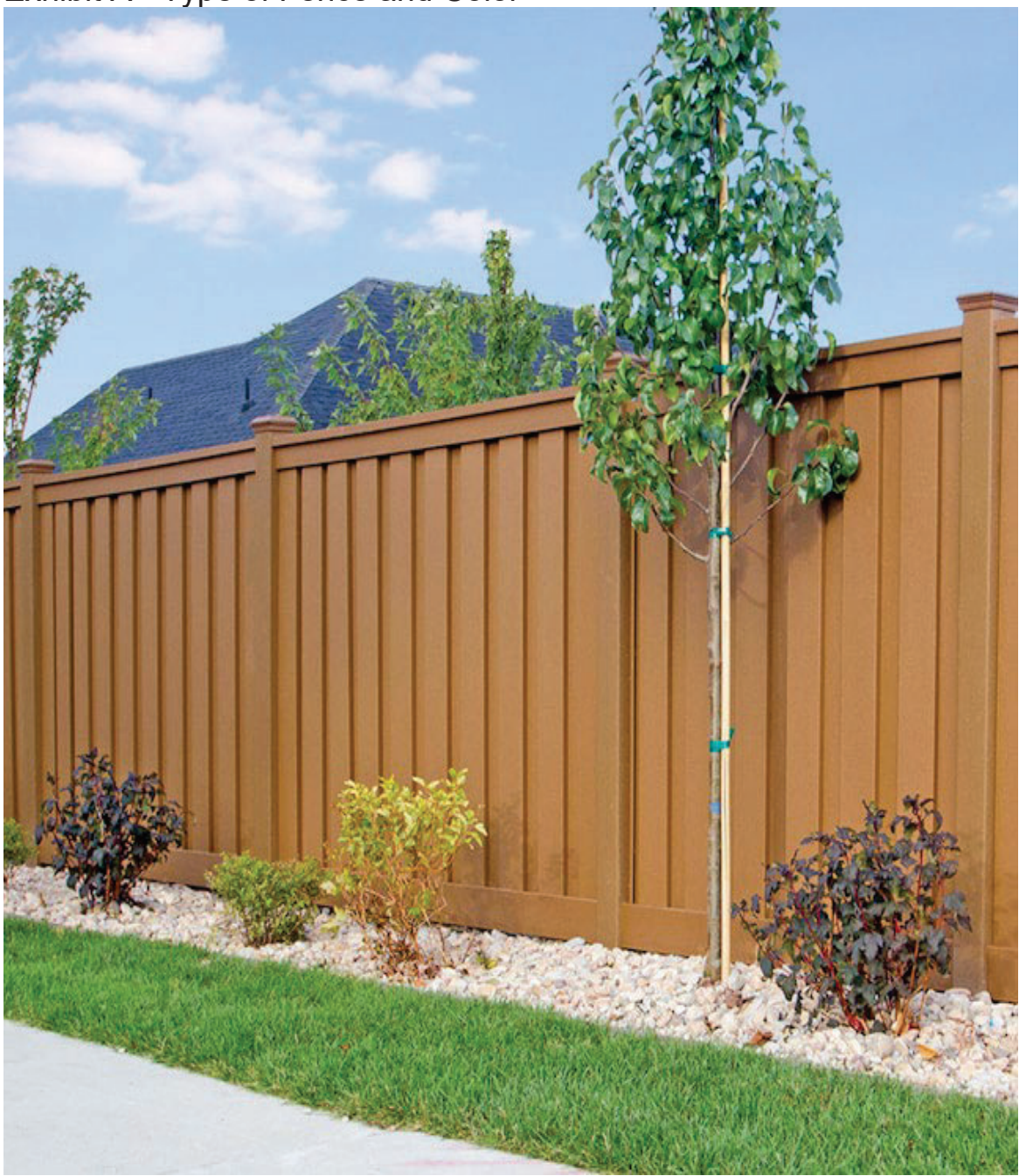
Exhibit A - Type of Fence and Color