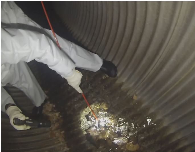
Figure 5 – Invert damage in 60" CAP