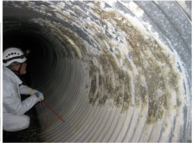
Figure 4 – Corrosion observed at top of 60" CAP.