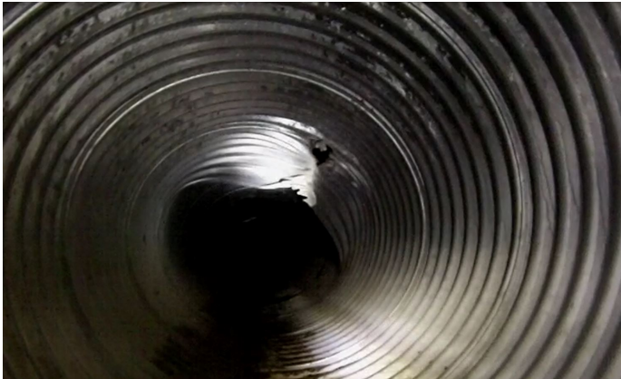
Figure 3 – 42" CAP Damaged by Horizontal Bore