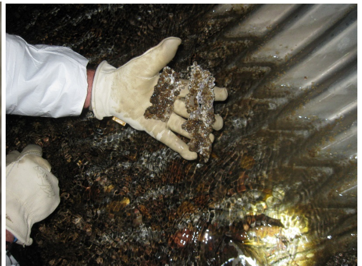
Figure 6 – More invert damage in 60" CAP