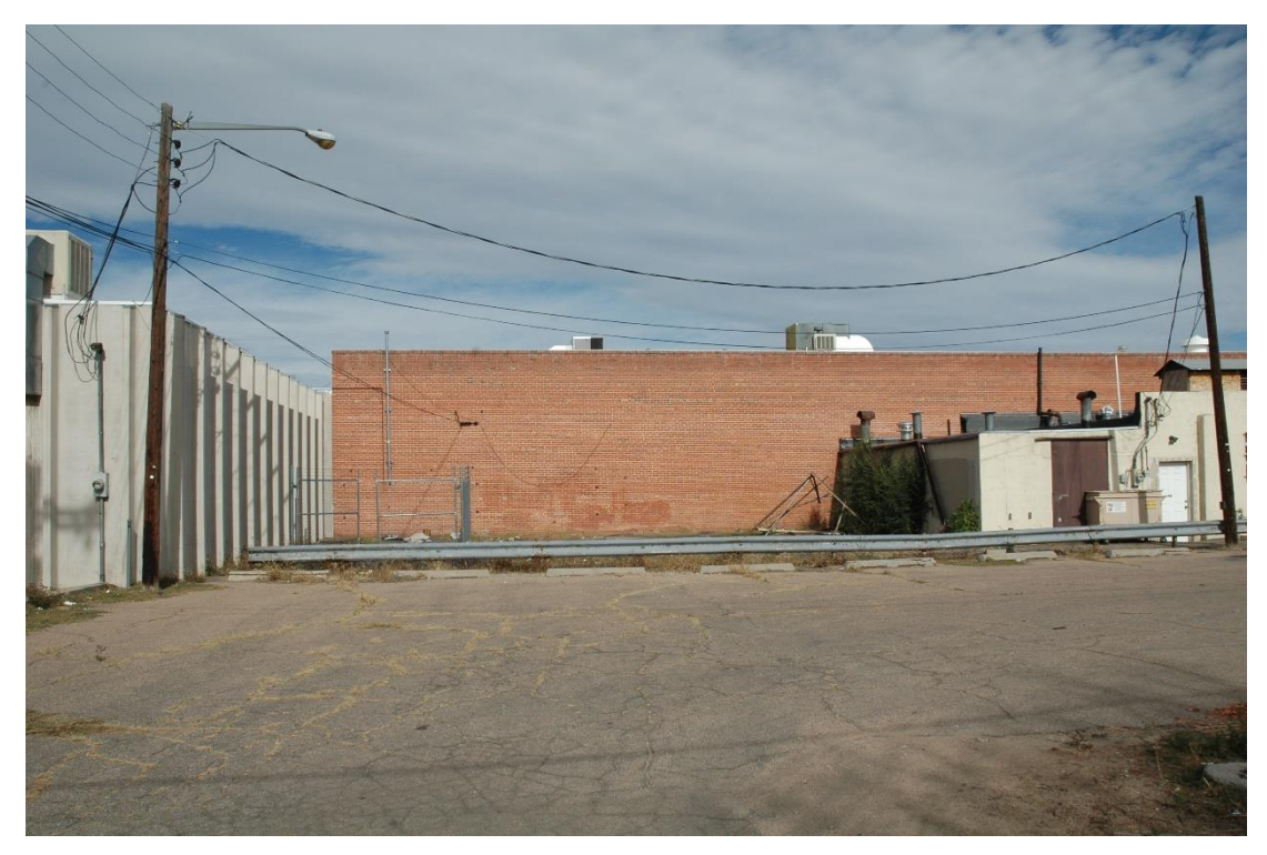
CD 1, Image 67, View to north of south side, and east side of the addition