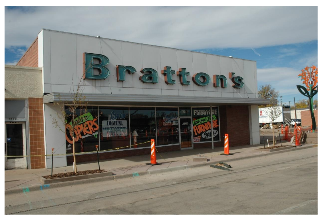
CD 1, Image 62, View to NW of façade (east)