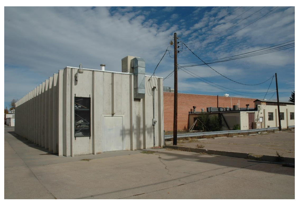
CD 1, Image 66, View to NE of south side and south and west sides of the addition