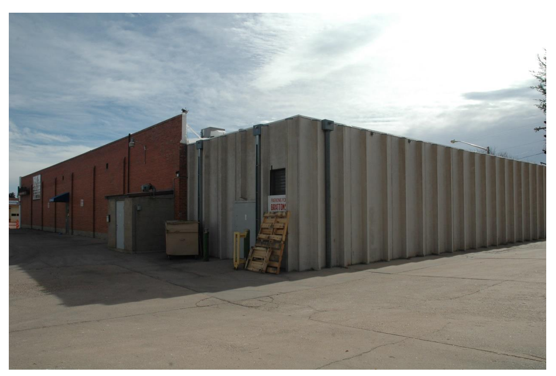
CD 1, Image 65, View to SE of north side and north and west sides of the addition