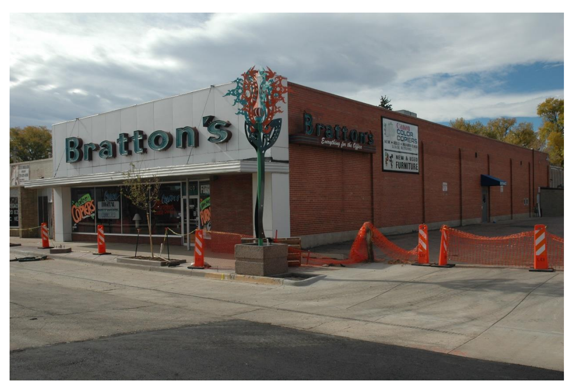
CD 1, Image 63, View to SW of façade (east) and north side