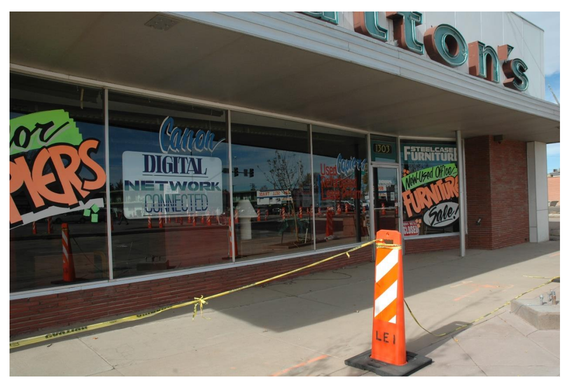
CD 1, Image 64, View to NW of lower façade (east)