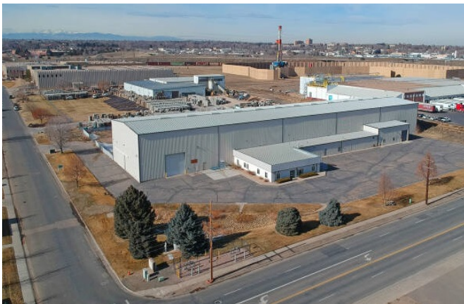
The former home of BMA America, the 46,600 square-foot building at 2985 First Ave. was selected by EMIT Technologies to create a state-of-the-art contract manufacturing operation.