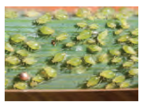
Figure 10: Tulip bulb aphids. (Parasitic mummy is lower left.)

Horticultural oils (Fact sheet 5.569, Insect Control: Horticultural Oils) have a special place in aphid control. These act largely by smothering insects and are particularly effective for control of aphids that spend the winter as eggs on the tree or shrub, then curl leaves the following spring. They are most widely used for aphid control on stone fruits (Prunus spp.), such as peach, apricot, and plum. Horticultural oils are applied before bud break, during the dormant season.