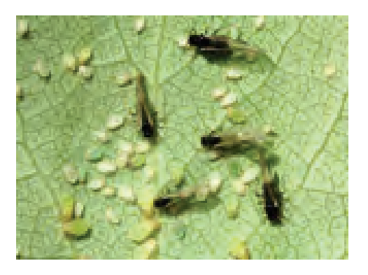
Figure 1: Adult aphids – winged and wingless.

*Colorado State University Extension entomologist and professor, bioagricultural sciences and pest management. 2/2009