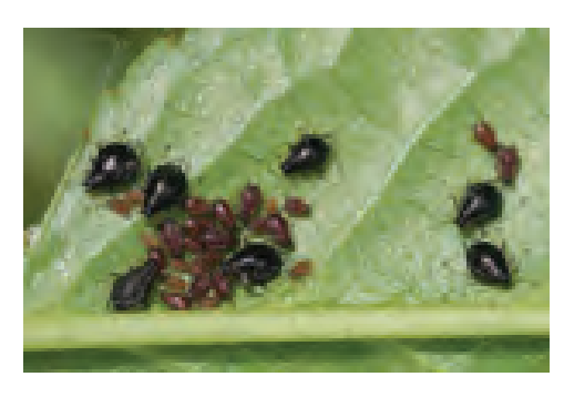
Figure 2: Black cherry aphid colony.

Some aphids obscure their body by covering themselves with waxy threads. These are known as "woolly aphids." Woolly aphids are most commonly seen associated with pines or other conifers, lining the needles. However, the woolly apple aphid is a common woolly aphid that clusters on the limbs of apples and crabapples. Aphids that cluster within leaves that curl, such as the leafcurl ash aphid, are wax covered as are most aphids that live on plant roots.