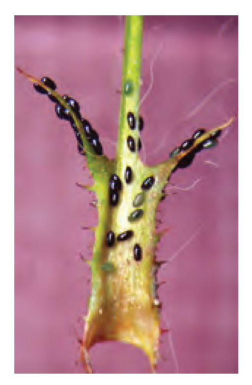
Figure 7: Overwintering eggs of rose aphid.