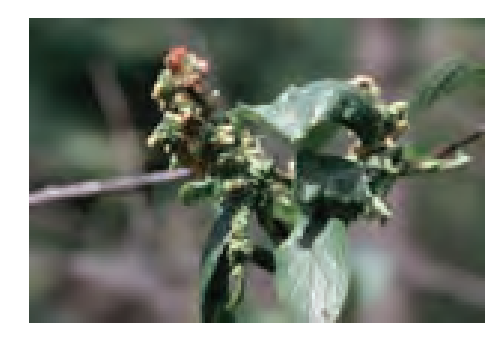
Figure 4: Leafcurl plum aphid injury.