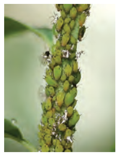
Figure 6: Spirea aphid colony.