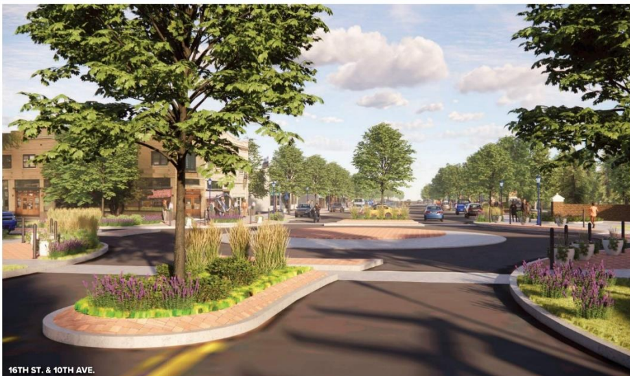
16TH ST. & 10TH AVE.