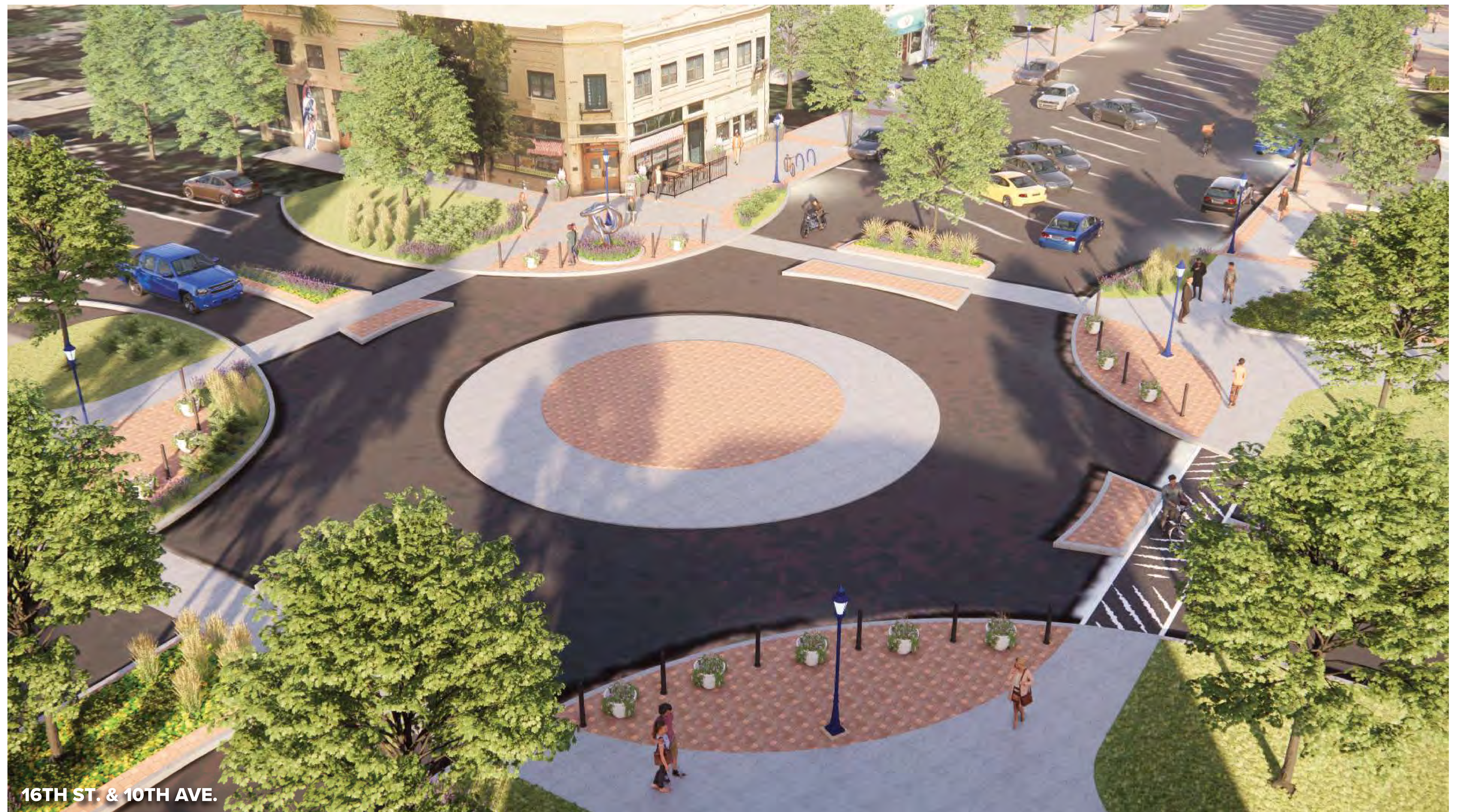
16TH ST. & 10TH AVE.