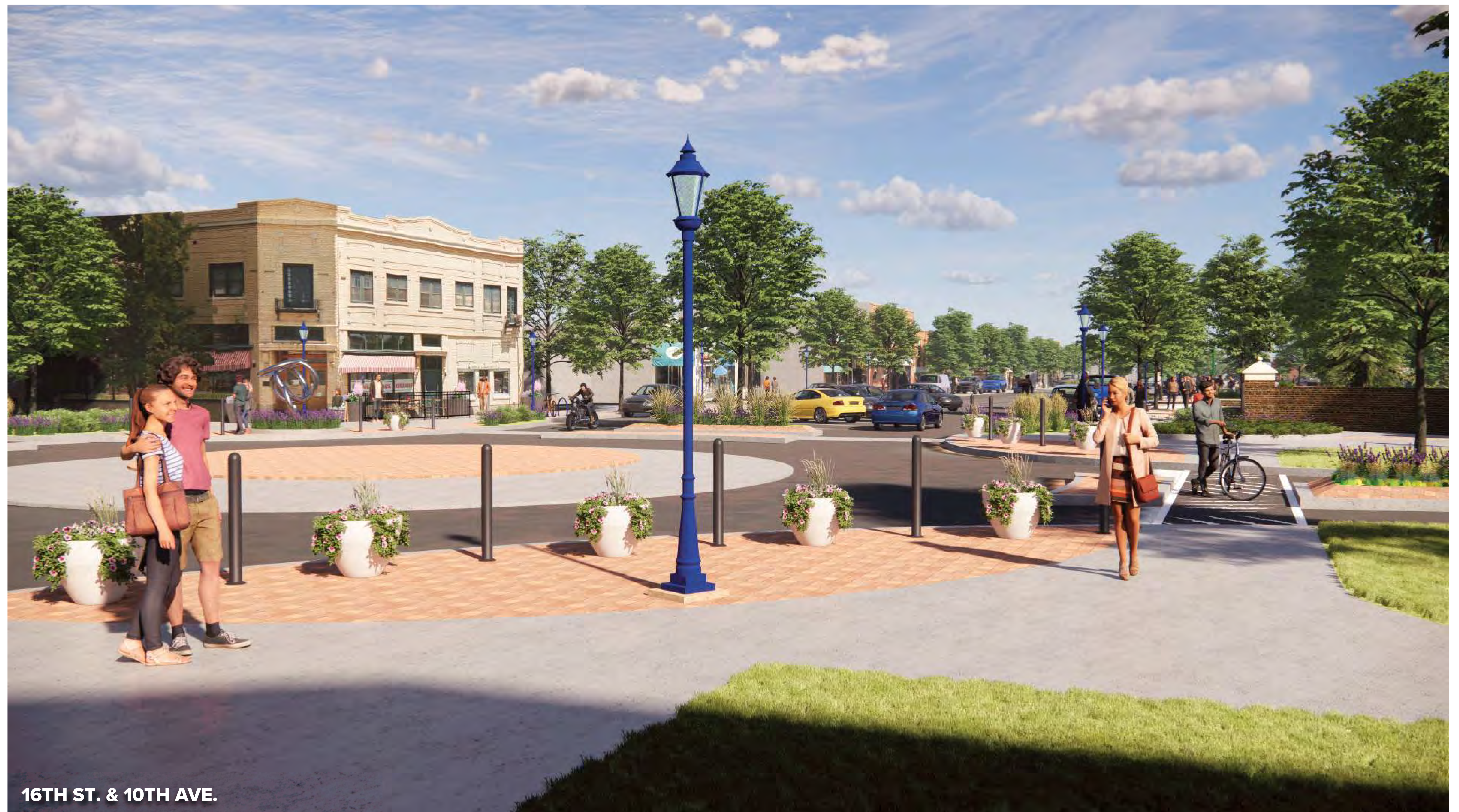
16TH ST. & 10TH AVE.