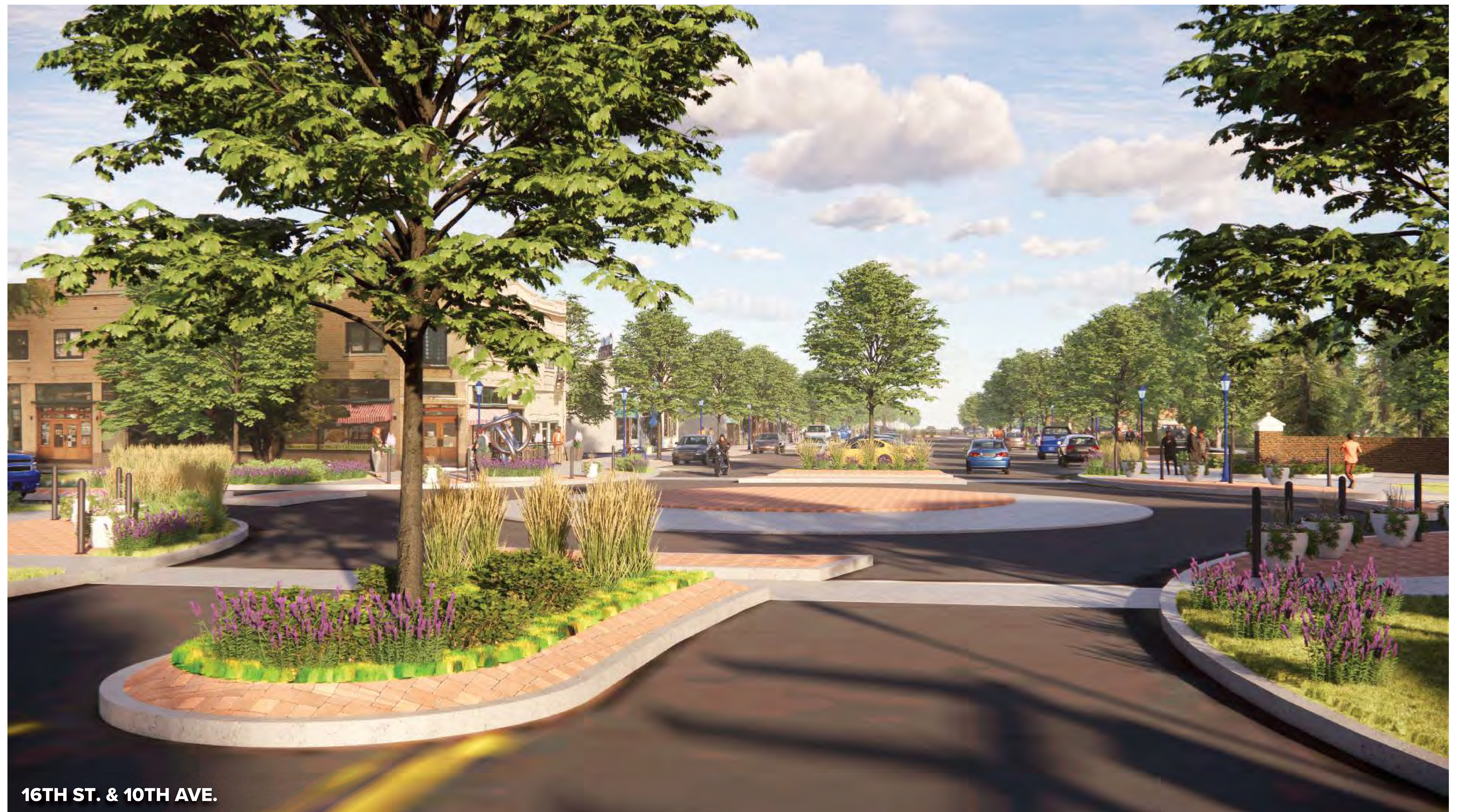
16TH ST. & 10TH AVE.